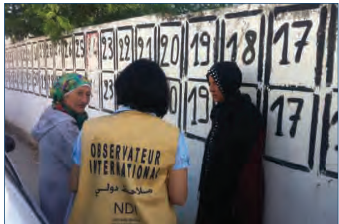
An NDI observer consults with voters in Manouba governorate.

Increase Citizen Engagement through Election Observation and Political Process Monitoring. Civil society groups – many of them newly formed and active in the more open environment since January 2011 – recruited thousands of volunteers to serve as nonpartisan election observers. This volunteer effort represented a notable expansion in citizen participation around elections compared to the Ben Ali era and demonstrated public enthusiasm for oversight of the country's unfolding political processes. To build on this initial experience, civic groups should continue to engage and recruit citizen volunteers to lead similar efforts in future elections, incorporating lessons learned from the NCA elections. They should also consider ways to monitor other aspects of the transition process – including the drafting of the new constitution. New to civic organizing in an open environment, Tunisian civil society groups should seek ways to form coalitions around shared goals and objectives.