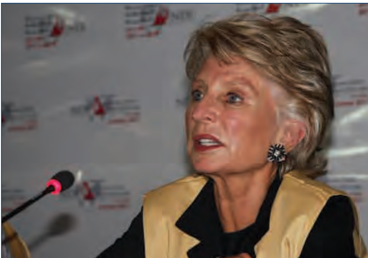
Former US Congresswoman Jane Harman speaks at NDI's press conference on October 24.