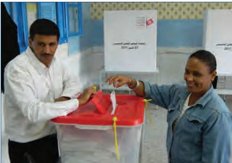
A woman casts her vote in Carthage.