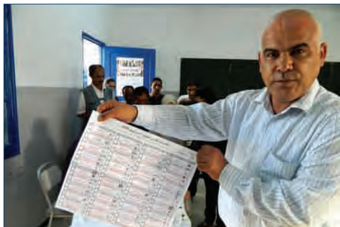
A polling official in a special polling center in Carthage shows a ballot featuring 76 candidate lists.

expressing more concern over security and economic issues, and less confidence in the ability of political leaders to contribute to improvements in peoples' daily lives.