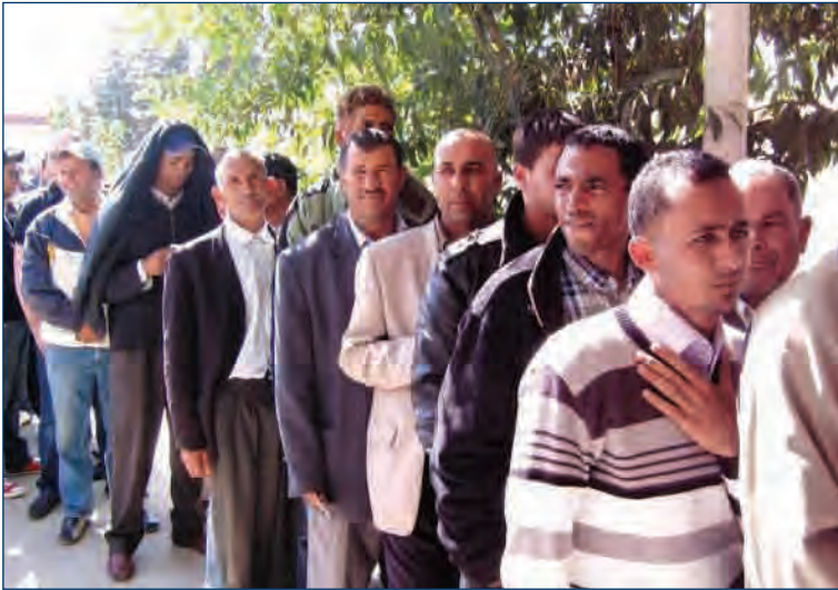
Male voters wait in the shade outside a polling station in Gafsa. In some southern governorates, men and women queued in separate lines.