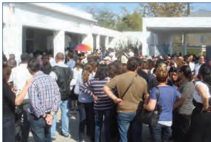
Voters queue on election day in downtown Tunis.

Initial reports from the press and the ISIE overestimated voter turnout, which was ultimately determined to be 52 percent of eligible voters (86 percent of registered voters and 16 percent of unregistered voters) 1 . Though impossible to compare with voter participation in previous elections—given questions about the accuracy of voter turnout figures released for previous elections by the MOI under Ben Ali—there is no doubt that more Tunisians voted in the 2011 NCA elections than had ever voted before.