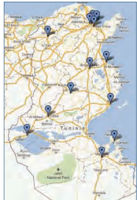
Map indicating deployment locations of NDI delegates.