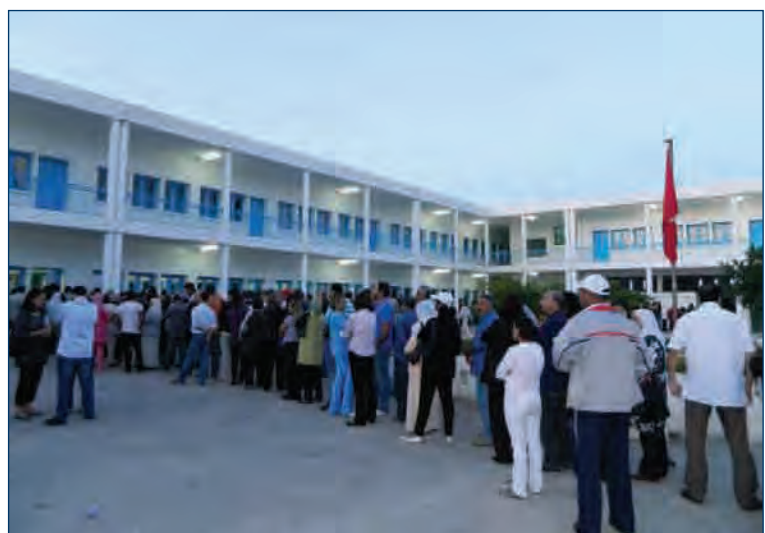
At the 7 PM closing of polls on election day in La Marsa, hundreds of voters remain in line. Officials at this polling station estimated that turnout among registered voters would reach 99 percent.