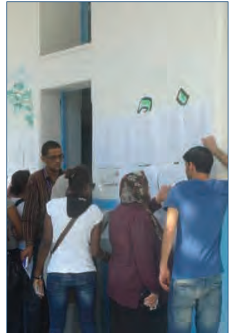
Voters look for their names on the voter register at a polling station in Tunis.

Create a Permanent Independent Election Commission. The newly-created High Independent Authority for Elections ( Instance Supérieure Indépendante pour les Elections or ISIE) overcame numerous obstacles to create a transparent electoral environment and encourage broad public participation in a free and fair process. The creation of a permanent body would augment and solidify these gains moving forward, and would lead to greater citizen confidence in future elections.