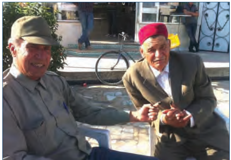
Voters in Manouba governorate proudly display their inked fingers. This was the first election that employed inking to prevent repeat voting.