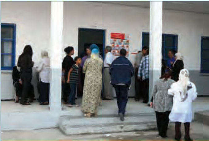
A special polling center for unregistered voters.

Elderly, disabled and illiterate voters were particularly affected by the confusing ballot and new procedures. While disabled voters were granted exceptional assistance to access polling stations and vote, official voting procedures prohibited illiterate voters from receiving assistance.