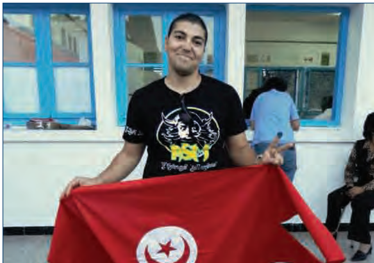
A young Tunisian proudly displays his country's flag outside a polling station in La Marsa.