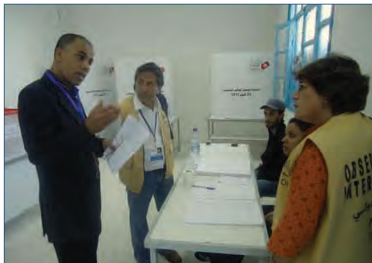
Former President of Peru Alejandro Toledo and Portuguese member of European Parliament Ana Gomes speak with a polling official in a Tunis polling station.