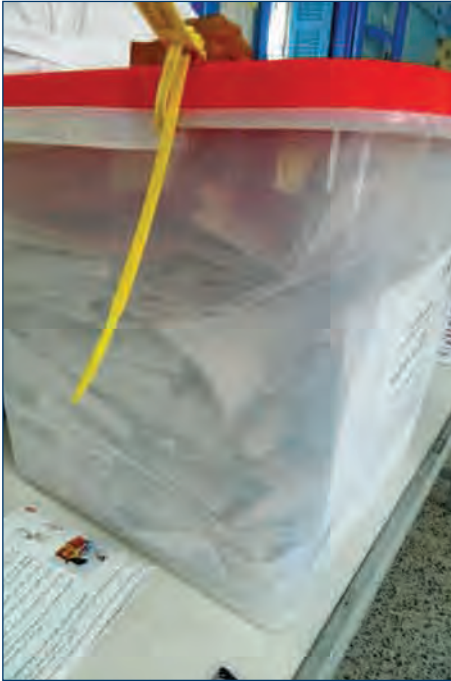
In certain districts, ballot boxes swelled as turnout among registered voters exceeded 90 percent.

In another first, Tunisia welcomed all international election observers who expressed interest in monitoring the polls. Twenty-three nongovernmental and intergovernmental organizations were accredited to field observers across the country, all of whom were welcomed by Tunisian transition authorities, polling officials and voters themselves.