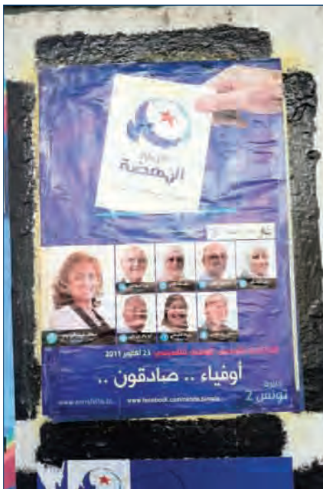
The Ennahda candidate list in the Tunis 2 district.

Perhaps more importantly than what the party's triumph means for Tunisia, Ennahda's victory could pave the way for other Islamist groups' participation in mainstream politics throughout the region, as already witnessed to some extent in election results in Morocco and Egypt. Ennahda – a political party whose leader was exiled for decades and whose members underwent years of imprisonment, harassment and abuse by state security services – has the opportunity to demonstrate to Tunisians and the international community the positive role moderate Islamist parties can play in democratic systems of governance.