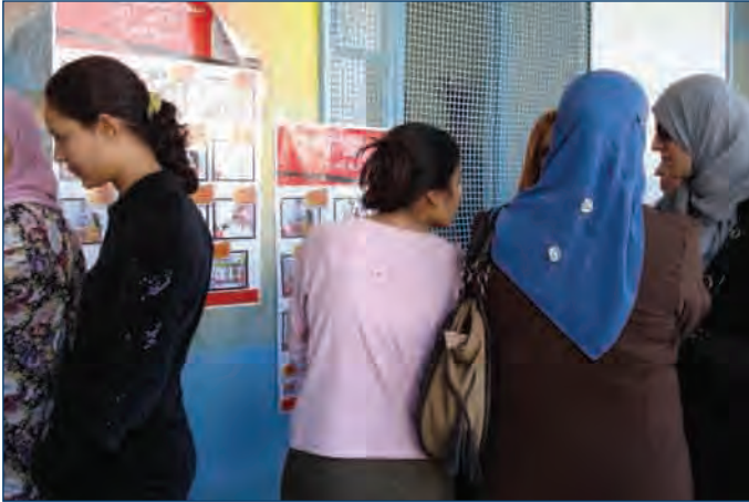
In line to vote in Tunis, women examine cartoons detailing procedures.

NDI observers uniformly remarked on the high degree of professionalism and dedication demonstrated by polling station officials and staff, nearly all of whom were involved in elections for the first time. Trained at the regional level with ISIE oversight, presiding officers and poll workers generally followed newly established rules and procedures and maintained calm and orderly environments in the stations. Observers noted that polling officials had sufficient voting materials and set up stations appropriately. Polling officials