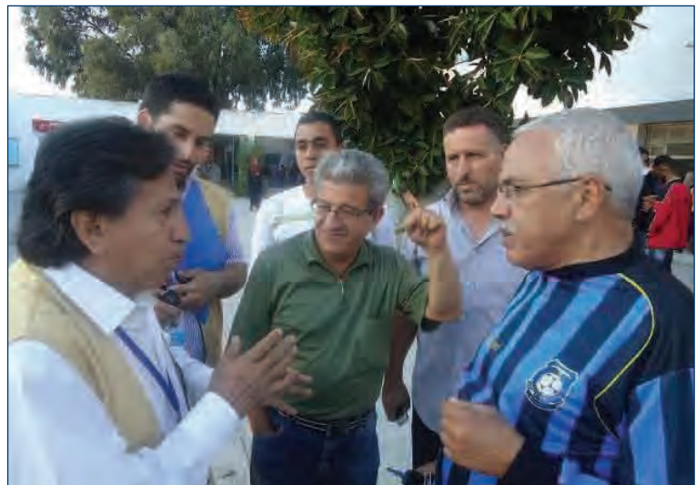
President Toledo discusses voters' experience in Tunis.