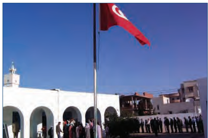
A polling station in Sidi Bouzid in central Tunisia.

While NDI delegates did not witness any widespread critical issues on election day, observers did report some instances of electoral violations, primarily involving illegal campaigning. By law, all campaigning was to cease 24 hours before polling, but some parties continued to publicly campaign on election day. For example, observers in Manouba reported one party's representatives discussing party platforms with voters waiting in line, and observed party stickers on cars parked near polling center entrances. Observers in Ariana, Gafsa and Jendouba also saw campaign posters and other materials in close proximity to polling stations.