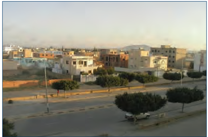
The town of Sidi Bouzid, in central Tunisia.

three seats. During the appeals process, an administrative court overturned the ruling and reinstated seven of Aridha's seats, but other members of the NCA refused to form a coalition with Aridha Chaabia. The group's unpredicted success and reactions to its victory exemplify challenges around enduring regional biases between Tunisia's educated urban population and citizens in the poorer rural interior of the country.