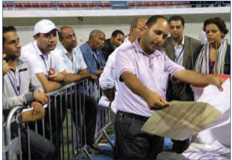
Two days after the election, domestic observers continued to witness tabulation at a center in El Menzah outside Tunis.