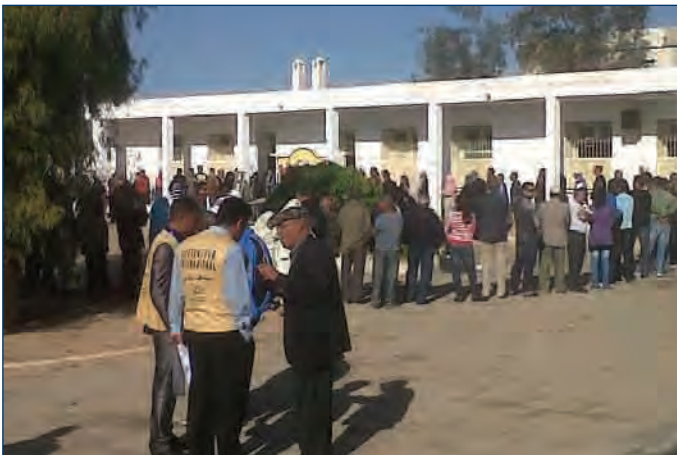
Observers consult with voters in Gafsa.

To demonstrate international support for Tunisia's transition process and these historic open elections, the National Democratic Institute (NDI) organized an election observation mission that included the deployment of 45 short-term observers (including NDI staff deployed on election day) and two long-term observers who witnessed the process before, on and after election day.