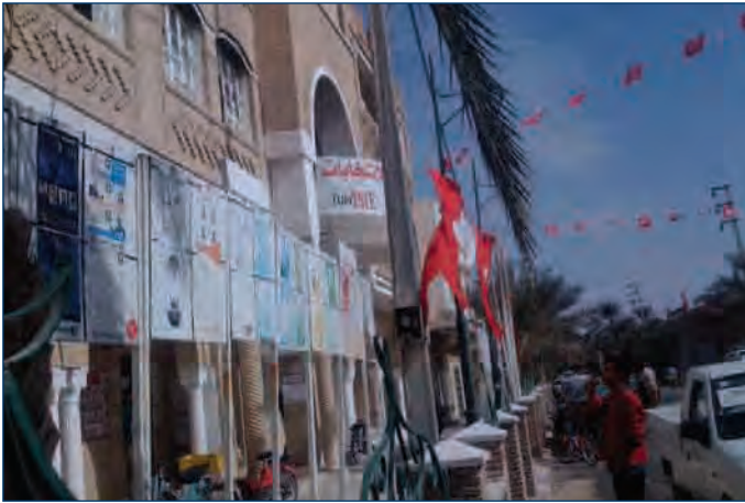
Candidate lists affixed outside the ISIE's office in Tozeur governorate.

in a country emerging from decades of authoritarian rule. Despite the organizational and logistical challenges of conducting the elections in a limited time period, the ISIE succeeded in organizing polls that largely lived up to citizens' desire for an open and transparent process.