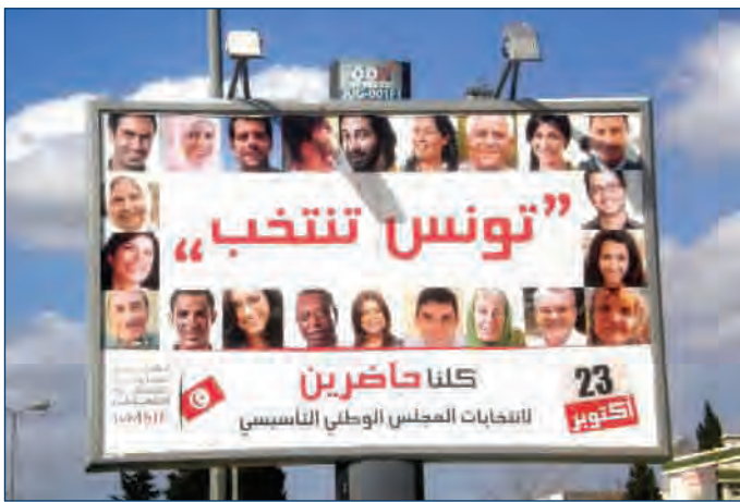
A billboard sponsored by the ISIE reads “Tunisia Votes.”

Tunisia's constituent assembly elections marked an important step in the country's transition toward a more democratic and representative form of government. Many Tunisians rightly saw the act of voting as a vital contribution to the emergent democratic process. Lessons learned from this first election will help strengthen electoral and political processes moving forward as the NCA drafts a new constitution and prepares for future elections. In this spirit, NDI offers the following recommendations: