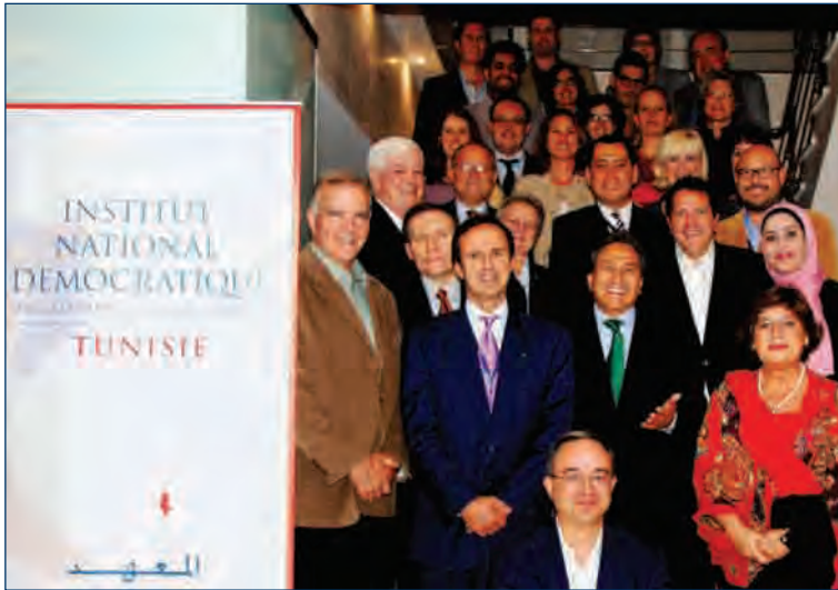
NDI's observer delegation included 47 observers representing 15 countries and territories.