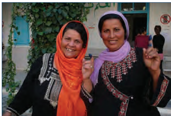
Voters in Sousse.

A “zipper system” required that both political party and independent candidate lists alternate between men and women, meaning that 50 percent of candidates in the election were women. In practice, parties designated men at the head of all but 7 percent of lists, and the majority of lists won only one seat per district. Notably, the Democratic Modernist Pole (PDM), a coalition of left-wing parties, came close to nominating women at the head of 50 percent of its lists. Ultimately, 58 women secured seats in the NCA, representing 27