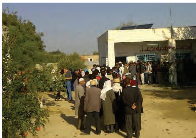
Voters queue outside a polling station in Kairouan governorate.