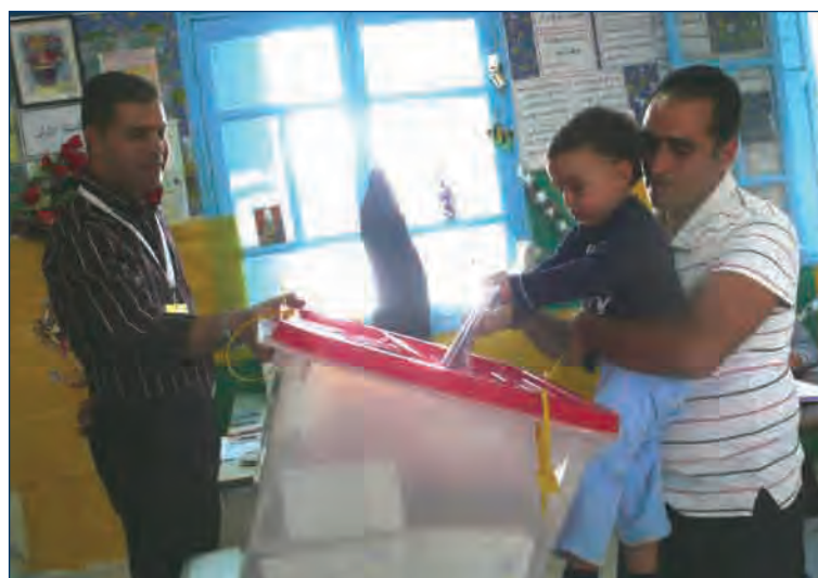
Voting in Sousse.