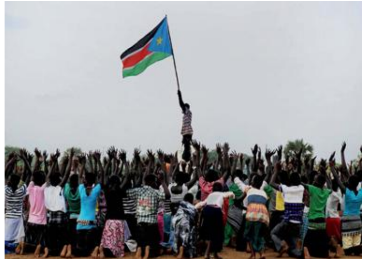
Citizens of South Sudan gather in a show of support for their new country.

In 2011, the world witnessed the creation of the Republic of South Sudan by popular referendum. After years of conflict, and prior to hostilities that broke out in late 2013, a wave of optimism swept the country as it looked towards its future. Still, it was clear that government officials, CSOs, nonprofits, and international actors in South Sudan needed information on the direction of the country and the sentiments of its people. Lacking local partners with the capacity to conduct national public opinion research, NDI served the role of infomediary to fill in this knowledge gap by conducting multiple rounds of focus group research . The focus groups helped define the attitudes and expectations of South Sudanese citizens over the period from 2004 to 2012, giving civic, political, and international actors a clearer picture of the new nation's most pressing concerns