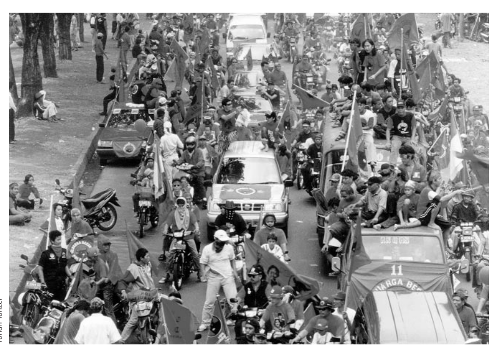
Campaign rally in Jakarta.

NDI is also conducting Asia programs in Bangladesh, Cambodia, Hong Kong, Malaysia, Nepal and Thailand. A regional program assists the development of an Asia election monitoring network.