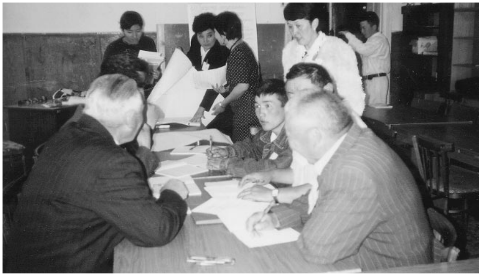
As part of a training exercise conducted in Naryn, Kyrgyzstan by the Coalition for Democracy and Civil Society, city government officials develop a mock strategy to increase citizen participation in the budget process. Different plans, developed in small group workshops, were later presented to participants at a larger gathering, which included the vice-governor, mayor and municipal department heads.

The Coalition has also managed to create an opening to allow citizen participation in the parliament. It has organized roundtables in Bishkek that enlist parliamentarians, government officials and civic activists to discuss draft laws. In addition, the Coalition has also submitted its own recommendations on draft legislation to parliament and the president's office including provisions relating to domestic election monitors, pollworkers and ballot security. Recommendations were later included in the election law.