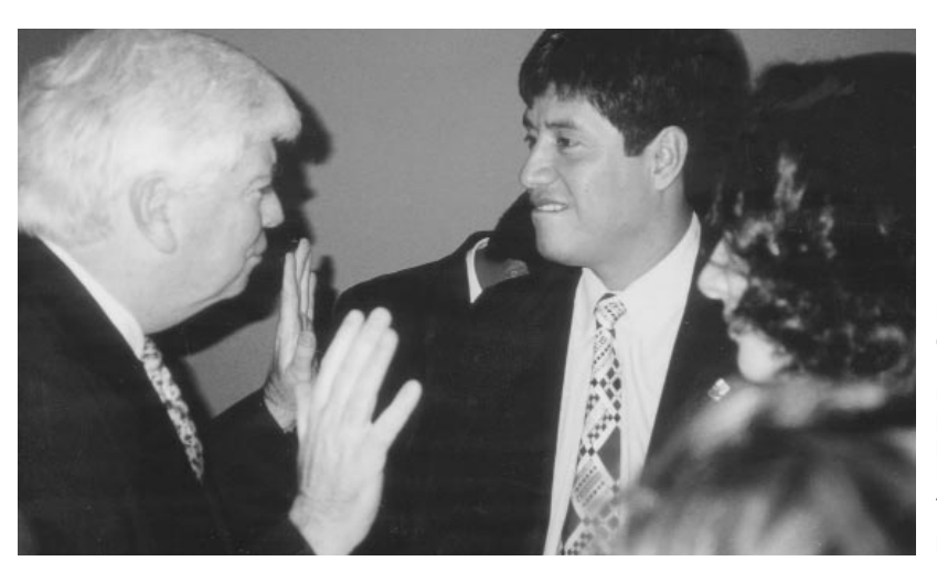
U.S. Senator Christopher Dodd meets with program participants in Latin America Leadership Program.

The two-week seminar launched 12 months of activities with the emerging leaders and their colleagues in each of the four countries. Participants will now draw on their new skills and NDI's international network of volunteer experts as