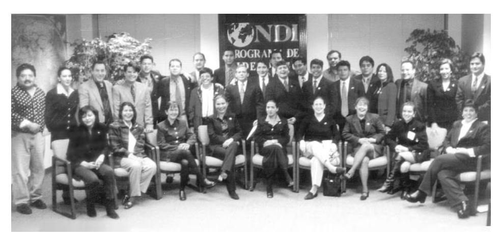
Participants in Latin American Leadership Program.

they implement party strengthening projects of their own design—from enhancing the political participation of women and indigenous citizens in Guatemala and promoting youth participation in political parties in Mexico, to building the training capacity of local branches of political parties in Paraguay and Venezuela. These activities allow the program to reach a broader audience within the parties and to build consensus about potential initiatives to strengthen the parties.