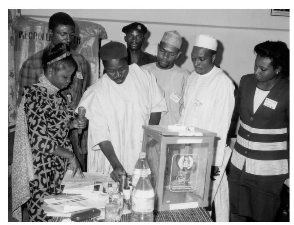
Members of the Transition Monitoring Group listen to an election official (left) describe the voting process during a training session for TMG monitors before polls in Nigeria.

In December, NDI joined with the Transition Monitoring Group (TMG) to organize a nationwide campaign to promote democratic polls and monitor the election process. The TMG, which began as a collection of eight, Lagos-based human-rights organizations, expanded during the course of four months into a diverse, nationwide coalition comprising 64 environmental groups, women's associations, religious organizations and others. NDI spent four months working with a corps of 500 trainers, who in turn trained more than 11,000 men and women who deployed as pollwatchers to all of Nigeria's 36 states. The TMG's post-election statements attracted widespread national and international media attention, and demonstrated how a Nigerian organization could cross polarized ethnic, regional