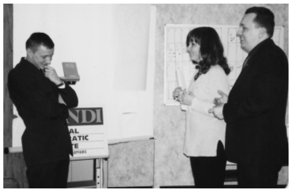
To prepare political party activists for the September elections, NDI held trainings on such techniques as door-to-door canvassing.