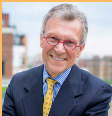
Tom Daschle NDI Board Chair

“The defining issue of the 21st century is the fight between freedom and oppression. The work NDI does has never been more important or in demand than at this moment in time.”