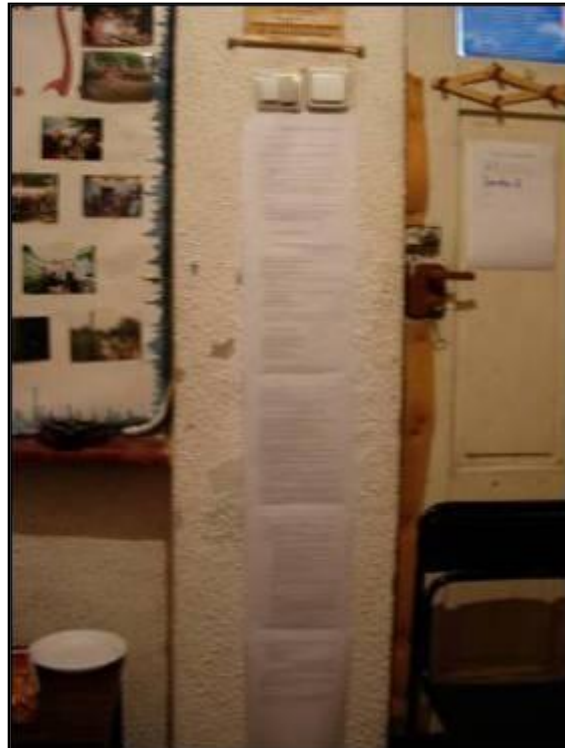
ARTI's statutes hanging in its office.

Assistance in Romania was targeted to specific individuals in the organization. For example, when groups were working on a press release, NDI did not hold training sessions for the entire organization, but only for the one or two individuals who were responsible for working with media. This was the same for creating structures and specific policies, such as accounting procedures. By targeting specific individuals, NDI's assistance was more in-depth and often took the form of "on-the-job" training, which was beneficial to the groups as they did not have to stop operations for a day to have the entire office attend a workshop most of the staff did not need.