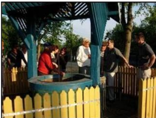
A well ADCP advocated the local government to build.

Trust is the underlying foundation for developmental partnerships. As noted earlier, the groups trusted NDI, and were more open to assistance and guidance. As a result, the collaborative process of creating a structured, formalized partnership illustrates that NDI listens to its partners and views them as peers. Conversely, NDI gains trust in its partners when they work to identify their needs and priorities; this illustrates the groups are serious about doing the work right, not just doing the right work.