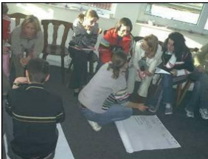
Workshop bringing members of partner groups together, allowing them to learn from each other.

Local partners must desire the assistance and understand its relevance. If the assistance is going to be absorbed and applied in a meaningful way, existing leadership (defined in terms of individuals that can envision a more capable organization in the future and that are willing to take responsibility for achieving the vision) is a must. When groups view themselves as agents of change, NDI can more easily help empower them to play that role. A