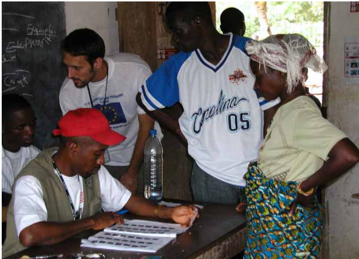
A polling official checks a voter's registration card against the final registration roll while an international observer looks on.