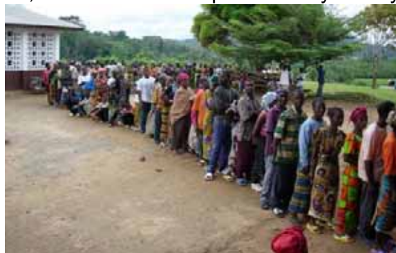
Voters wait in line for hours to vote on October 11.

Election administrators, political parties, and voters faced extraordinarily difficult logistical conditions on election day. In rural areas, some voters complained of having to travel long distances to polling places. Roads were in disrepair because of years of war and therefore presented transport problems, which were compounded by heavy downpours during the rainy season. Approximately 10 percent of the electorate voted in polling places that were not accessible by road, requiring polling agents to trek for four days in some cases to deliver polling materials to points where they could not be transported by vehicle. Some of these were in areas difficult to reach even with the assistance of UNMIL helicopters. The NEC and UNMIL made extraordinary efforts to ensure delivery and collection of polling materials to and from these locations.