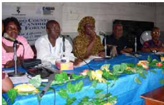
Candidates discuss their platforms at a debate in Montserrado County.

NDI/Carter Center observers noted that with so many registered political parties participating in the elections, the differences among parties were not always clear to voters. However, candidate debates for the presidential and legislative elections gave citizens the opportunity to raise issues and for candidates to articulate their positions on matters of national interest. Some candidates used audiotapes, distributed to community radio stations for broadcast, to provide greater access to information to voters in rural areas.