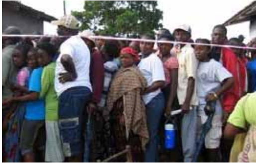
Liberian voters wait in line to vote on October 11.

With the inauguration of the newly-elected president, vice president, and legislature in January 2006, Liberia is now poised to turn an historic corner toward sustainable peace and democratic governance. By their actions, Liberians sent a strong message that the country must turn its back on war and autocratic rule.