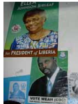
Campaign posters for Ellen Johnson Sirleaf and George Weah, the two runoff candidates.

Weah and Sirleaf sought the endorsements of former presidential hopefuls, other political parties, civic groups, and opinion leaders. Six of the first round presidential candidates endorsed Weah, while four others endorsed Sirleaf. Many Liberian voters, however, expressed frustration with the endorsements of their party leaders and did not necessarily follow those endorsements in choosing their preferred candidate in the runoff election.