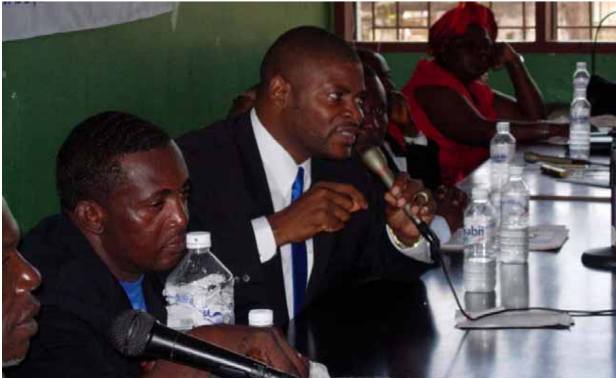
Senatorial candidates discuss policy positions during a debate in Grand Bassa County.

The legal framework for the 2005 elections in Liberia contained numerous provisions that were seen by many as among the most advanced in the world. For example, campaign finance regulations are among the most comprehensive on the continent, though they proved difficult to implement in the Liberian context. Provisions concerning voting for persons with physical disabilities, which are particularly relevant in societies that have suffered armed conflict, are also highly developed.