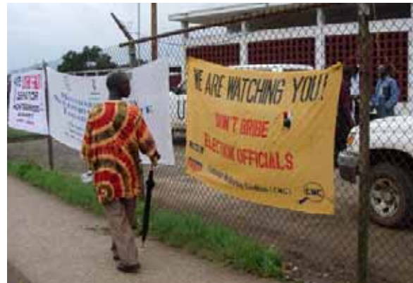
Voter education banners hang on a fence.

Many observers were told that some Liberians did not understand the rationale for a runoff election. Liberian civic and community-based organizations used radio, town meetings, and group discussions to explain the importance of the runoff. Voter education efforts also sought to encourage voters to participate in the second round election even if their first round candidate of choice was no longer in the race.