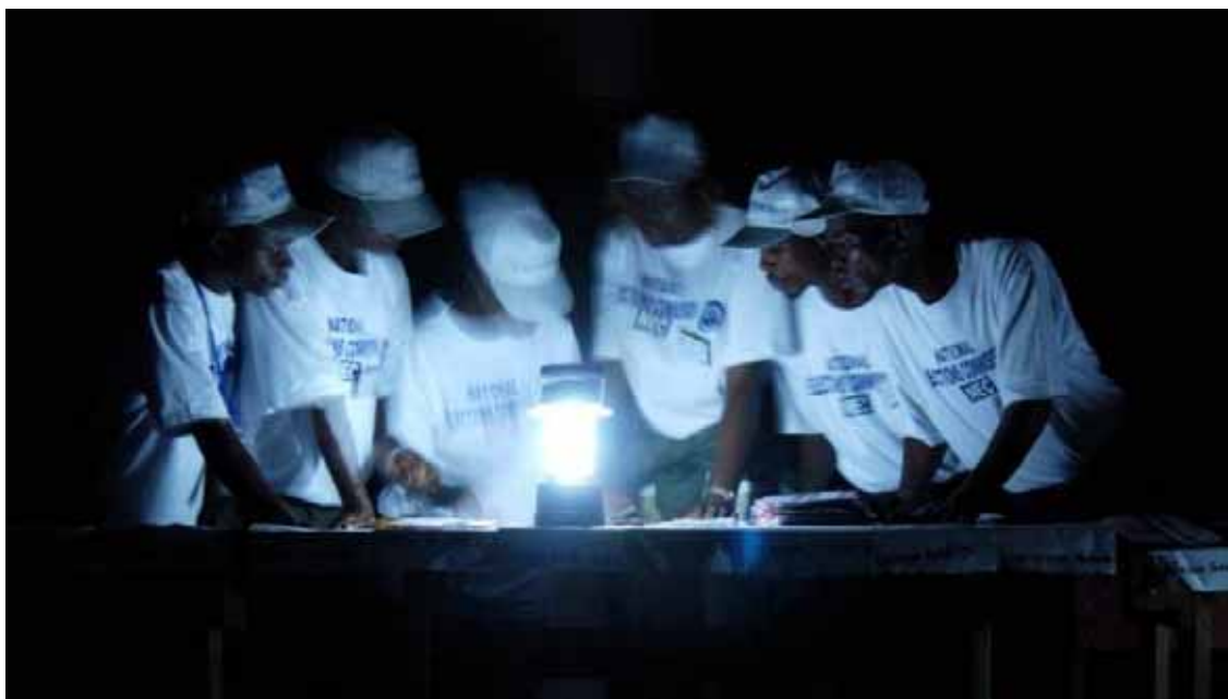
Polling officials count ballots by lantern light on October 11.