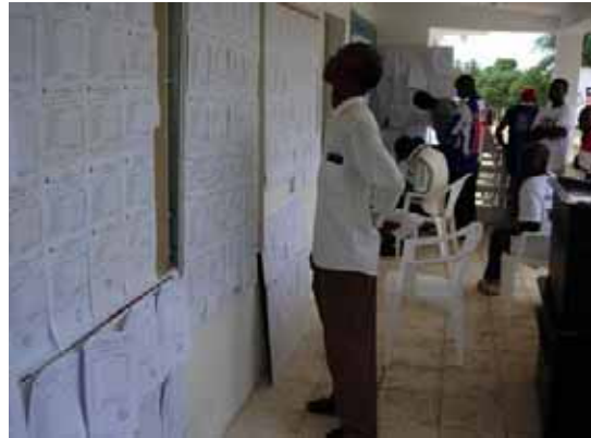
Liberians review the tabulated results as they are posted at the NEC county office in Saniquellie, Nimba County.

On November 23, 2005, the NEC announced official election results and declared Ellen Johnson Sirleaf president-elect, with 59.4 percent of the vote in the presidential runoff.