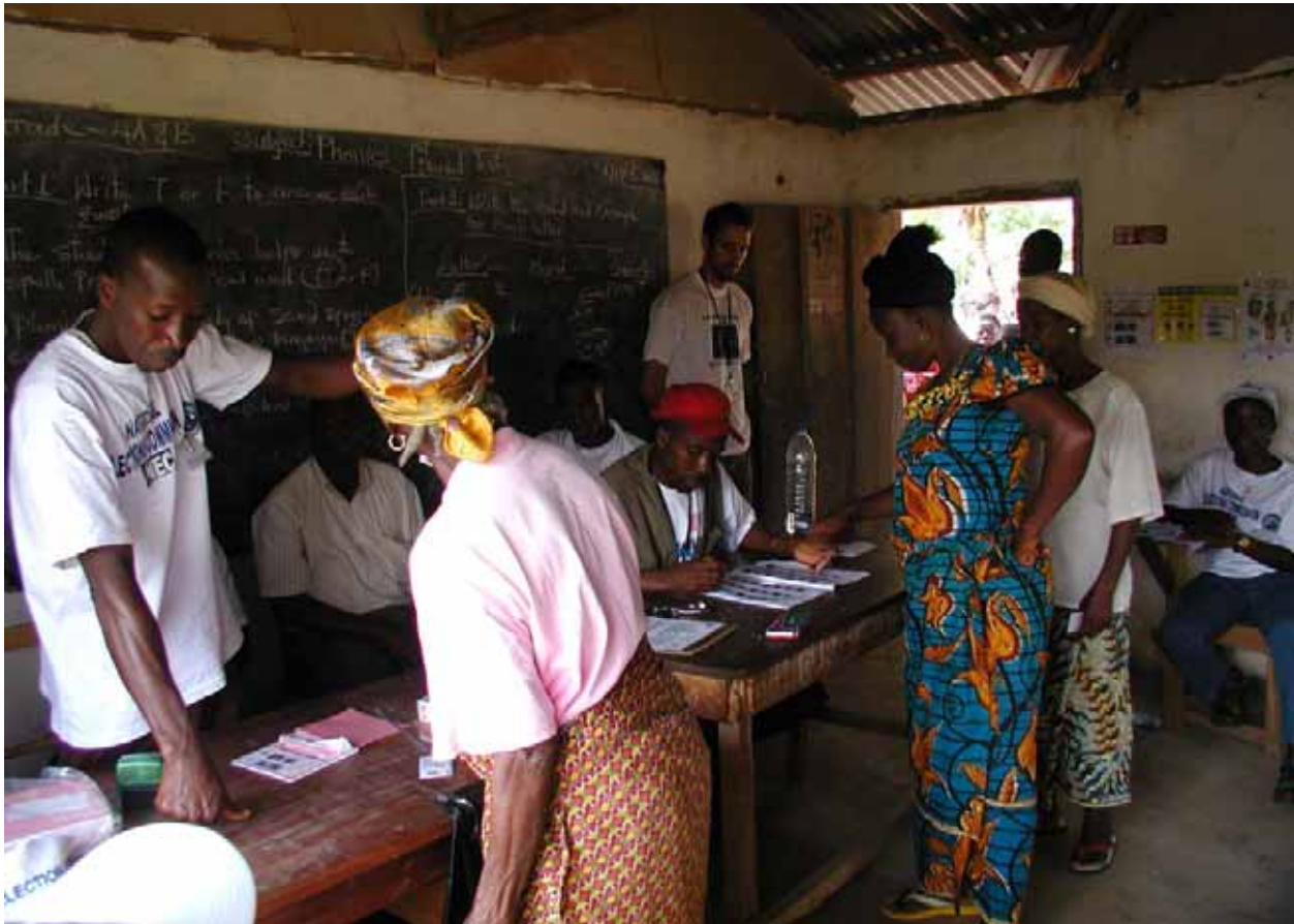
International and domestic observers watch as Liberian voters are identified and receive ballots during the runoff election.

NDI and The Carter Center also wish to express their deep appreciation to Liberian government officials, political and civic leaders, election commissioners, and poll workers who facilitated the work of the delegation. Most important, NDI and The Carter Center would like to thank the Liberian people for their warmth and hospitality.