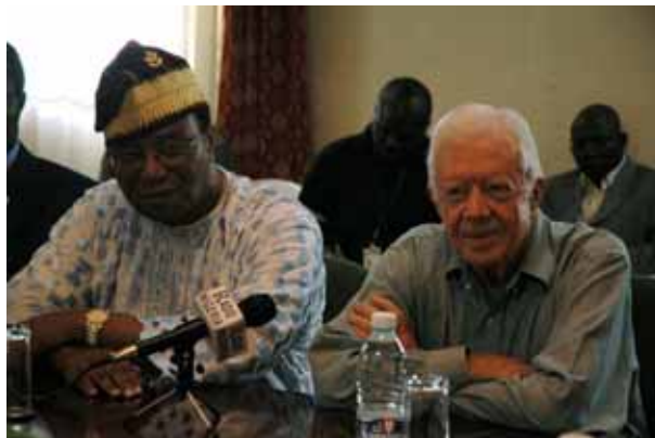
Former President Nicéphore Soglo of Benin and former U.S. President Jimmy Carter discuss the findings of the NDI/Carter Center international observation delegation during the first round of elections.

From September 1 through 9, 2005, an international pre-election delegation assessed the political environment in Liberia in advance of the October 11 presidential and legislative elections. 1 The delegation met with a broad spectrum of Liberian political and civic leaders, government officials, electoral authorities, and representatives of the international community in Monrovia. In addition, the delegation traveled to Bomi, Bong, and Grand Bassa Counties, 2 where it was briefed by Liberians in those localities. In-country staff members and LTOs who visited all 15 counties in the months preceding the delegation also briefed the delegation.