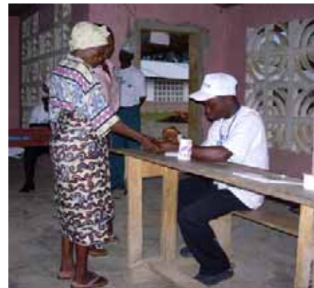
An election official puts indelible ink on a voter's fingernail after she cast her ballot.

During the runoff, presiding officers were instructed not to assist voters; voters needing assistance were advised to bring a family member or friend to the polls to help them cast their ballot. These instructions appeared to have been routinely followed, and the simpler ballot meant that far fewer voters required assistance.