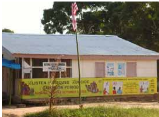
Banners and signs were used to raise voter awareness across the country.

Conditions during the pre-election period impact the degree to which elections can be judged as credible. Monitoring the electoral environment in the months preceding the election provides an opportunity to assess preparations for election day and determine the extent to which candidates compete on a level playing field and citizens participate in the electoral process.