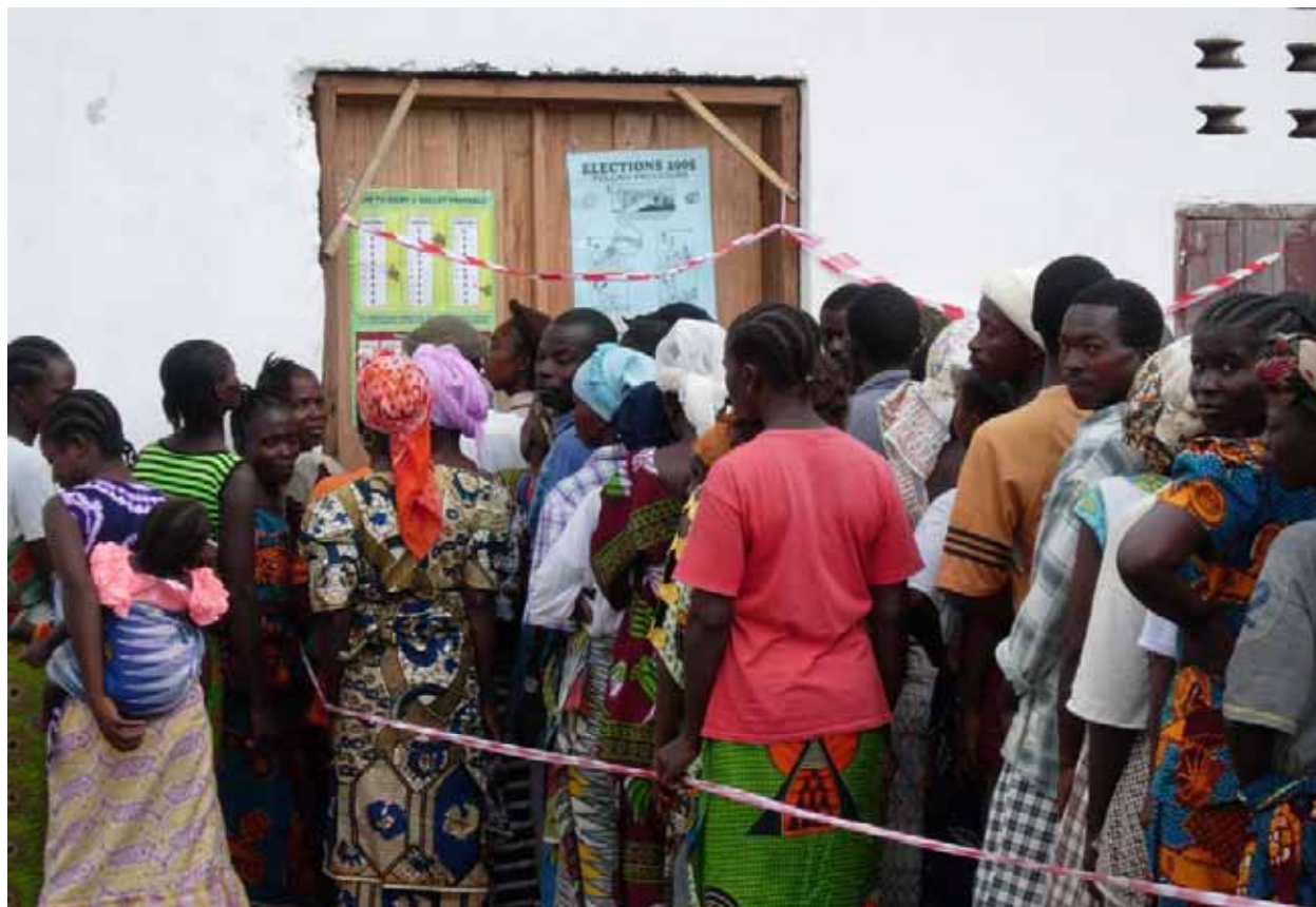
Crowds of voters wait in line to vote on October 11.

The 2005 national elections were a watershed moment in Liberia's history, and Liberians deserve credit for the high level of citizen participation, and the peaceful conduct and administration of the elections, which all bode well for the country's nascent democracy. However, for the country to achieve lasting peace and development over the long-term, Liberia's new leaders and its people must demonstrate a sustained commitment to credible elections and democratic governance.