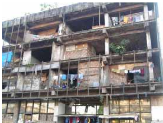
Building projects abandoned during the civil war dot Liberia's countryside.

In 1980, Master Sergeant Samuel Doe, an ethnic Krahn of native African descent, led a group of junior military officers in a coup against then-President William Tolbert, ending the long-serving Americo-Liberian oligarchy. Doe formed a People's Redemption Council (PRC), which sought to redistribute political and economic power to indigenous Liberians. Doe became popular with much of the population at the beginning of his term. However, he soon lost that good will as his leadership style turned increasingly authoritarian, and certain segments of the population continued to feel excluded from political and economic power.