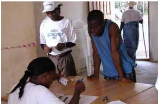
A polling official checks a voter's identification card against the final registration roll on election day.

In IDP camps, an estimated 61,000 Liberians registered to vote, with 71 percent planning to vote in their respective counties of origin. When it became clear that large numbers of those could not return home for election day, the NEC ruled that such persons would be allowed to vote for the president and vice president in their camps, but not for the county-based House and Senate seats. This decision was heralded as an effort to enfranchise as many voters as possible, although it was made very late in the electoral process and only after IDPs threatened to disrupt the electoral process.