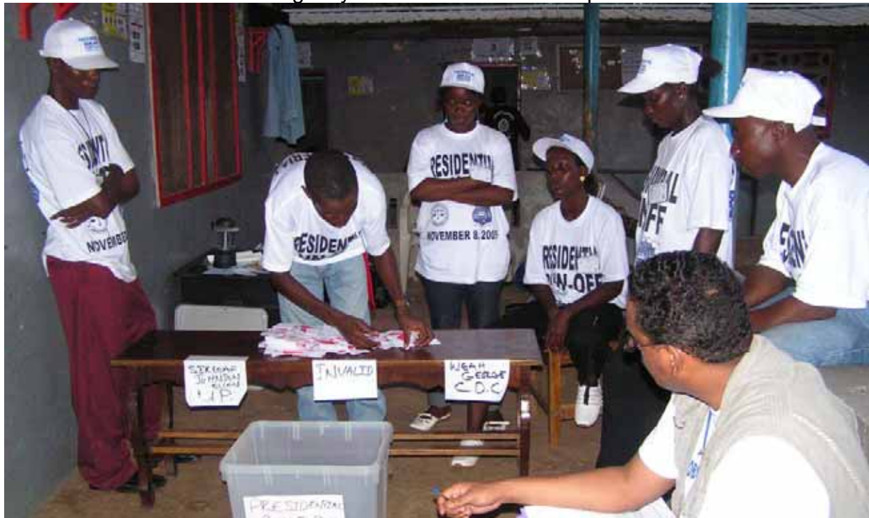
An international election observer watches the counting process for the runoff election.