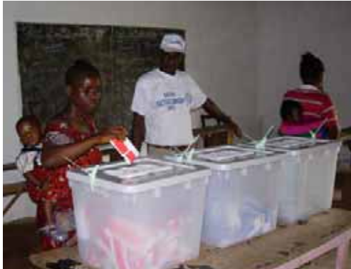
A voter casts her ballots on October 11.

Senate ballots averaged 10 candidates per county. Sample ballots were prepared by the NEC to assist in voter education efforts; however, they were only delivered to the counties several weeks in advance of the election.