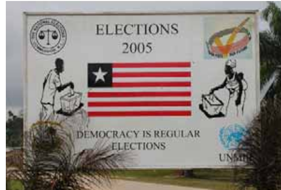
Banners in many parts of the country encouraged Liberians to vote in the 2005 elections.

As part of a comprehensive effort to contribute to the enhancement of democratic processes in Liberia, NDI and The Carter Center worked together to observe Liberia's 2005 electoral process. Through a pre-election mission, two observer delegations, and long-term observation, NDI and The Carter Center sought to demonstrate international support for Liberia's democratic process and to provide Liberians and the international community with an impartial and accurate assessment of the electoral process and the political environment surrounding it.