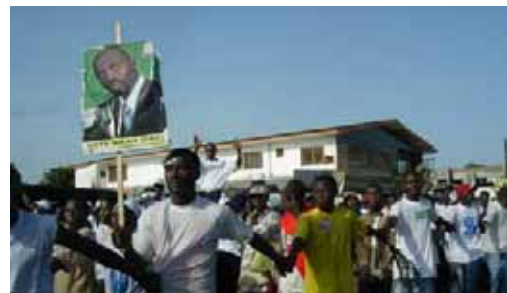
Partisans of the Congress for Democratic Change rally in support of George Weah for president.

The NEC rejected five independent presidential aspirants, three vice presidential nominees, and nine contenders for the House of Representatives for failing to fulfill application requirements. Many of the rejected applicants' petitions to contest the elections lacked the requisite number of registered voters' signatures. Due to the short timeline between the nomination period and election day, there was no official appeals process for parties or independent aspirants whose candidacies were rejected.