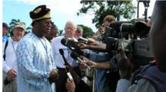
Former President Nicéphore Soglo of Benin and former U.S. President Jimmy Carter brief the media on the NDI/Carter Center international observation delegation for the first round election.

The Liberian media played an important role in informing and educating the Liberian public about the electoral process. Radio stations were particularly useful in disseminating information in English and local languages. The effectiveness of newspaper coverage was limited, as the illiteracy rate for the country is estimated at 80 percent. Distribution of print media is also limited to the parts of the country that are accessible by road.