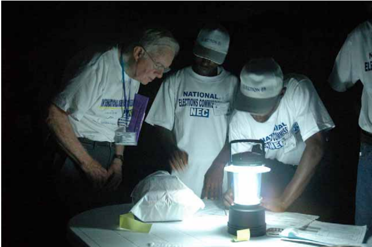
Former U.S. President Jimmy Carter watches as election officials record the results in a polling precinct in Montserrado County.

Hearings on complaints were open to accredited observers, but information about them was not widely disseminated in advance; and lax procedures for notifying candidates of hearing dates and times caused some parties to miss their appointments. Many of the complaints were based on misinterpretations of election procedures or law, and the NEC adjudicator ruled that some would be more appropriately handled by the criminal justice system. Overall, the adjudication procedures left some complainants feeling that their cases were not resolved satisfactorily. Regrettably, public statements by some political leaders and their supporters that called into question the declared results of the first round contributed to an atmosphere of distrust and suspicion during the runoff campaign.