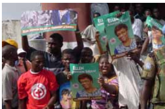
Unity Party supporters rally in support of Ellen Johnson Sirleaf for president.

The NEC's Campaign Finance Guidelines were comprehensive and wide reaching, although they proved difficult to enforce given in-country conditions at the time of the election. Campaign finance regulations set restrictions on the source of campaign funds, prohibited the use of bribes to entice voters, and imposed disclosure requirements to make all campaign finance information public.