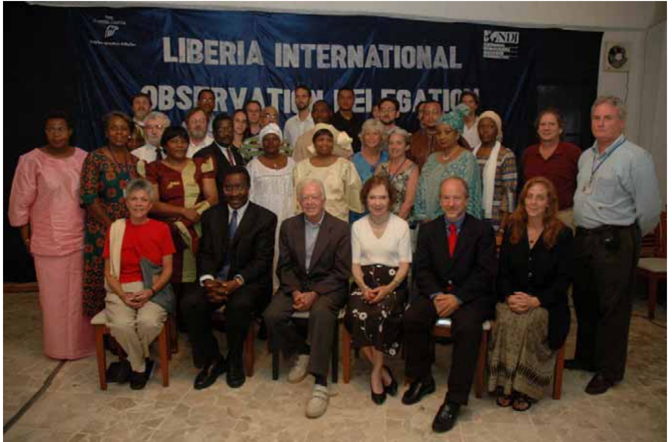
NDI/Carter Center International Election Observation Delegation for Liberia's first round national elections