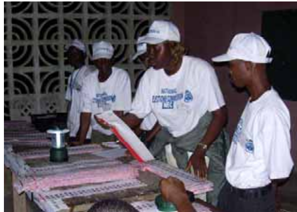
Polling officials count presidential ballots by lantern light on October 11.

The presiding officer for each polling site was responsible for communicating the results to the county tabulation center, where the County Magistrate tabulated provisional results from the county's polling precincts. The tabulation process began slowly due to the late finish of counting and logistical difficulties that delayed the arrival of results at county tabulation centers in many cases. With the assistance of UNMIL, tabulation results were relayed to Monrovia via the Internet on a rolling basis. The cumulative provisional results were announced by the NEC in Monrovia on a rolling basis, as they were compiled.