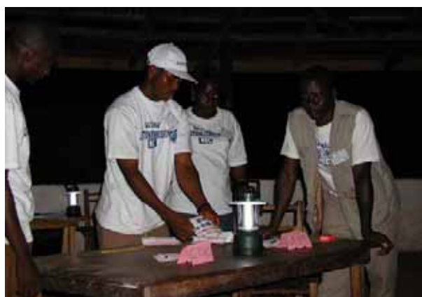
Polling officials count runoff ballots in Tapita, Nimba County.

In a few cases, the delegation noted inconsistencies in polling place administration. For example, some polling agents voted before the polls opened rather than at the end of the day as stipulated in the revised election procedures; the procedure for reconciling ballots at the end of the day was not followed in a few instances; the numbers of ballots received were not always registered on the presiding officer's worksheet; and the number of party representatives allowed in polling places varied from site to site. Observers were informed that in a number of polling sites, larger sample ballots posted in ballot booths bore marks indicating the choice of a candidate, though in all cases these ballots were immediately removed as soon as the attention of the polling officer was drawn to them.