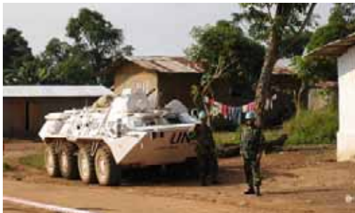
UNMIL soldiers provide security near a polling precinct on election day.

Taylor's departure paved the way for the signing of the Comprehensive Peace Agreement (CPA) in August 2003 in Accra, Ghana by representatives of Taylor's former government, armed militias (the LURD and MODEL), political parties, and civil society organizations. The CPA defined the structure and scope for a transition authority--the National Transitional Government of Liberia (NTGL)--that would guide the country toward elections in 2005, with the installation of an elected government by January 2006. Disputes arising within the NTGL were to be settled by mediation arranged by ECOWAS in conjunction with the United Nations, African Union, and ICGL. Representatives from the groups signing the CPA were given positions in the NTGL and the new 76-member National Transitional Legislative Assembly (NTLA).