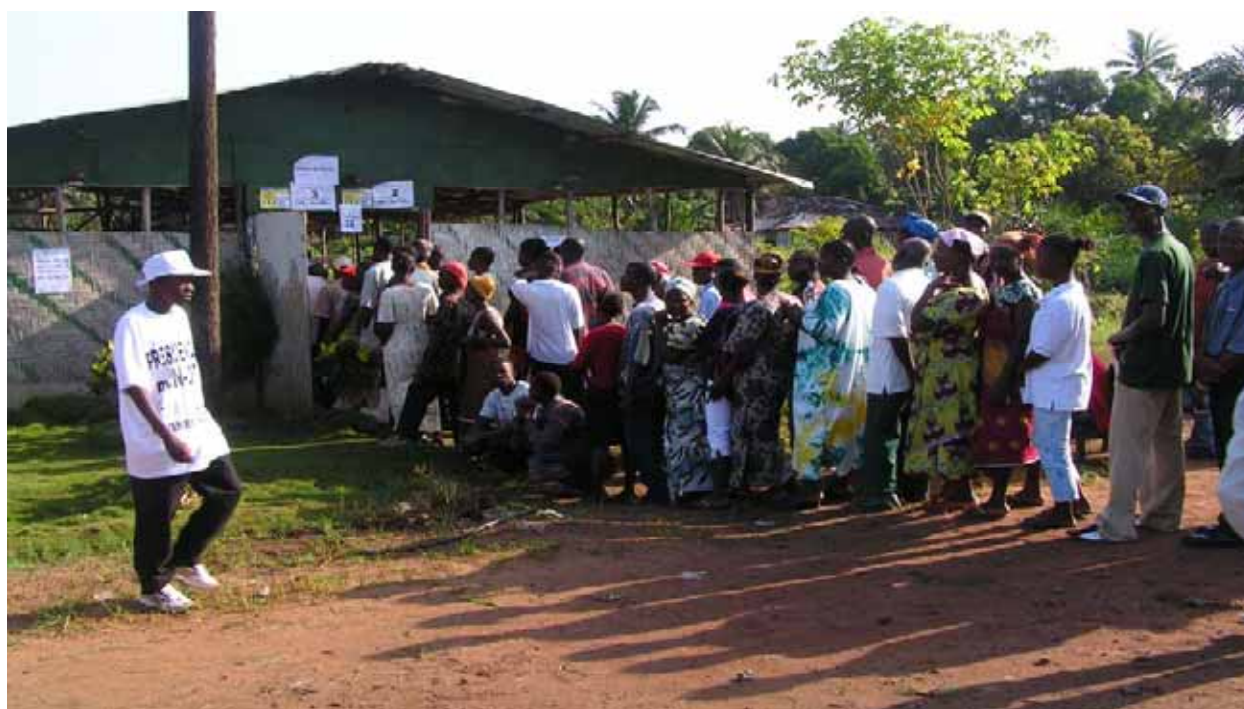
Liberian voters wait in line at a polling precinct in Grand Bassa County.