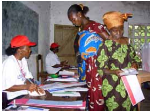
Voters receive presidential, senatorial, and representative ballots on October 11.

The voting process for the presidential and legislative elections proceeded relatively smoothly. Both the NEC and UNMIL made efforts to correct procedural errors as soon as they were noticed and to maintain orderly conduct throughout the process. The NEC put in place procedures to facilitate communication and safeguards to enhance the credibility of the vote. For example, to prevent individuals from voting more than once, voter cards were punched and voters' right thumbnails were marked with indelible ink. To track the number of ballots issued, polling officials were required to stamp the back of each ballot at the time of issue and to reconcile the number of ballots at the closing of the polls.