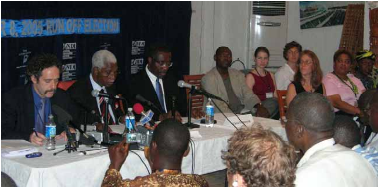
The NDI/Carter Center international observation delegation to the runoff election briefs the media on its findings.

LTOs fielded by The Carter Center provided briefings and logistical support for the main observer delegations. The observers traveled the country beginning in July, visiting every county to witness all subsequent stages of electoral preparation, including campaigning, voting, and tabulation. These observers provided a comprehensive picture of developments throughout the country during the entire electoral process.