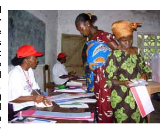
Voters receive presidential, senatorial, and representative ballots on October 11.

The voting process for the presidential and elections proceeded legislative relatively Both the NEC and UNMIL made smoothly. efforts to correct procedural errors as soon as they were noticed and to maintain orderly conduct throughout the process. The NEC put in place procedures to facilitate communication and safeguards to enhance the credibility of the vote. For example, to prevent individuals from voting more than once, voter cards were punched and voters' right thumbnails were marked with indelible ink. To track the number of ballots issued, polling officials were required to stamp the back of each ballot at the time of issue and to reconcile the number of ballots at the closing of the polls.