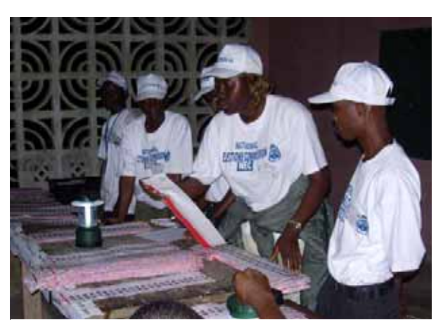
Polling officials count presidential ballots by lantern light on October 11.

The presiding officer for each polling site was responsible for communicating the results to the county tabulation center, where the County Magistrate tabulated provisional results from the county's polling precincts. The tabulation process began slowly due to the late finish of counting and logistical difficulties that delayed the arrival of results at county tabulation centers in With the assistance of many cases. UNMIL, tabulation results were relaved to Monrovia via the Internet on a rolling basis. The cumulative provisional results were announced by the NEC in Monrovia on a rolling basis, as they were compiled.