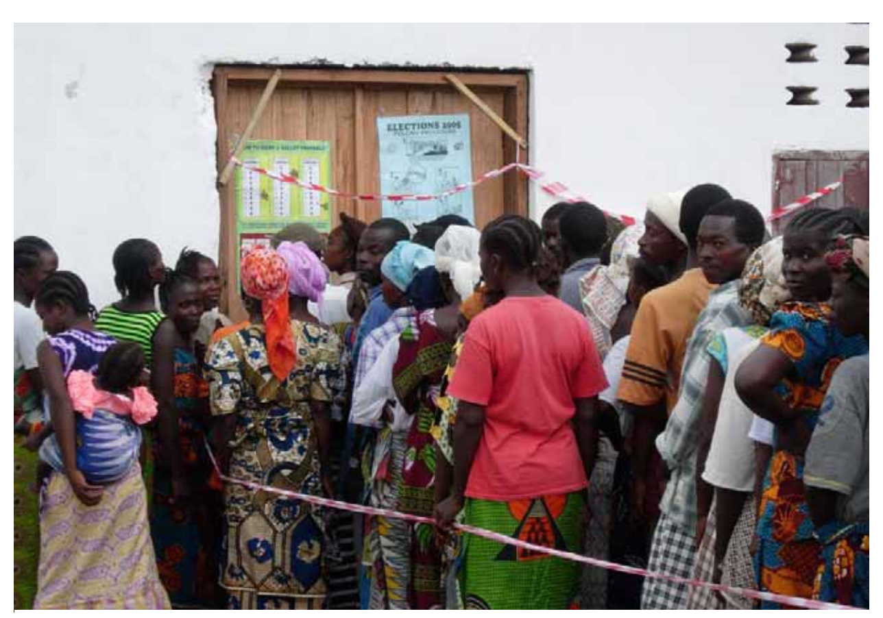
Crowds of voters wait in line to vote on October 11.

The 2005 national elections were a watershed moment in Liberia's history, and Liberians deserve credit for the high level of citizen participation, and the peaceful conduct and administration of the elections, which all bode well for the country's nascent democracy. However, for the country to achieve lasting peace and development over the long-term, Liberia's new leaders and its people must demonstrate a sustained commitment to credible elections and democratic governance.