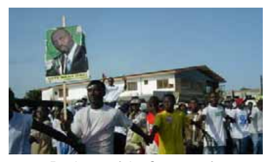
Partisans of the Congress for Democratic Change rally in support of George Weah for president.

The NEC rejected five independent presidential aspirants, three vice presidential nominees, and nine contenders for the House of Representatives for failing to fulfill application requirements. Many of the rejected applicants' petitions to contest the elections lacked the requisite number of registered voters' signatures. Due to the short timeline between the nomination period and election day, there was no official appeals process for parties or independent aspirants whose candidacies were rejected.