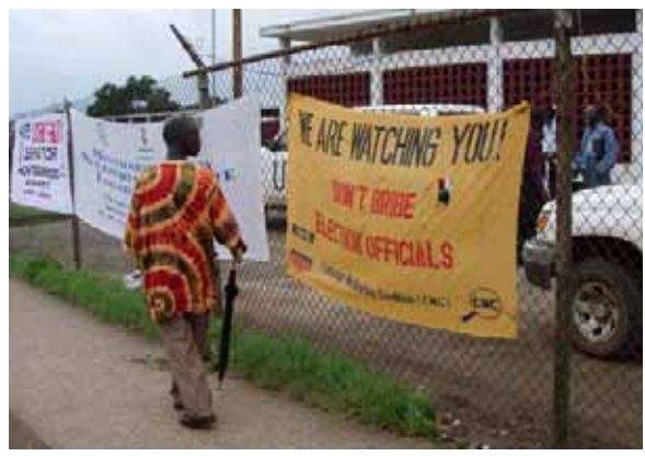
Voter education banners hang on a fence.

Many observers were told that some Liberians did not understand the rationale for a runoff election. Liberian civic and community-based organizations used radio, town meetings, and group discussions to explain the importance of the runoff. Voter education efforts also sought to encourage voters to participate in the second round election even if their first round candidate of choice was no longer in the race.