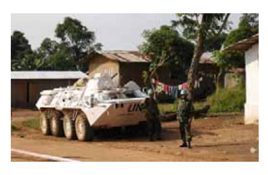
UNMIL soldiers provide security near a polling precinct on election day.

Taylor's departure paved the way for the signing of the Comprehensive Peace Agreement (CPA) in August 2003 in Accra, Ghana by representatives of Taylor's former government, armed militias (the LURD and MODEL), political parties, and civil society organizations. The CPA defined the structure and scope for a transition authority--the National Transitional Government of Liberia (NTGL)--that would guide the country toward elections in 2005, with the installation of an elected government by January 2006. Disputes arising within the NTGL were to be settled by mediation arranged by ECOWAS in conjunction with the United Nations, African Union, and ICGL. Representatives from the groups signing the CPA were given positions in the NTGL and the new 76-member National Transitional Legislative Assembly (NTLA).