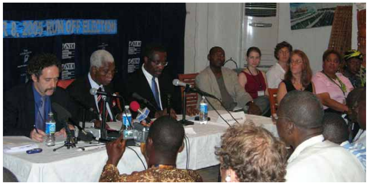
The NDI/Carter Center international observation delegation to the runoff election briefs the media on its findings.

LTOs fielded by The Carter Center provided briefings and logistical support for the main observer delegations. The observers traveled the country beginning in July, visiting every county to witness all subsequent stages of electoral preparation, including campaigning, voting, and tabulation. These observers provided a comprehensive picture of developments throughout the country during the entire electoral process.