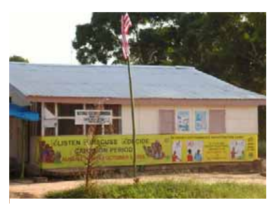
Banners and signs were used to raise voter awareness across the country.

Conditions during the pre-election period impact the degree to which elections can be judged as credible. Monitoring the electoral environment in the months preceding the election provides an opportunity to assess preparations for election day and determine the extent to which candidates compete on a level playing field and citizens participate in the electoral process.