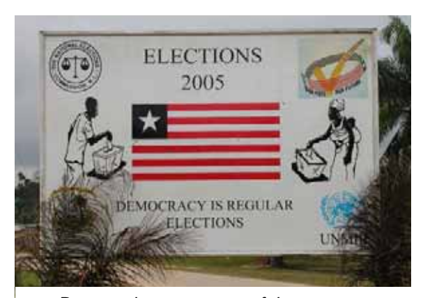
Banners in many parts of the country encouraged Liberians to vote in the 2005 elections.

As part of a comprehensive effort to contribute to the enhancement of democratic processes in Liberia. NDI and The Carter Center worked together to observe Liberia's 2005 electoral process. Through a preelection mission, two observer delegations, and long-term observation, NDI and The sought Center to demonstrate international support for Liberia's democratic process and to provide Liberians and the international community with an impartial and accurate assessment of the electoral process and the political environment surrounding it.