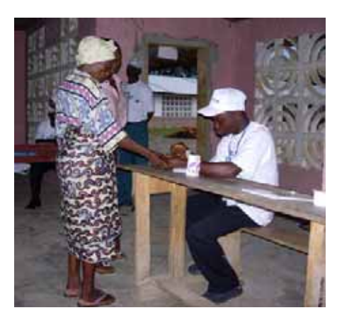
An election official puts indelible ink on a voter's fingernail after she cast her ballot.

During the runoff, presiding officers were instructed not to assist voters; voters needing assistance were advised to bring a family member or friend to the polls to help them cast their ballot. These instructions appeared to have been routinely followed, and the simpler ballot meant that far fewer voters required assistance.