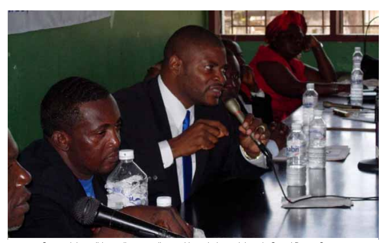
Senatorial candidates discuss policy positions during a debate in Grand Bassa County.

The legal framework for the 2005 elections in Liberia contained numerous provisions that were seen by many as among the most advanced in the world. For example, campaign finance regulations are among the most comprehensive on the continent, though they proved difficult to implement in the Liberian context. Provisions concerning voting for persons with physical disabilities, which are particularly relevant in societies that have suffered armed conflict, are also highly developed.