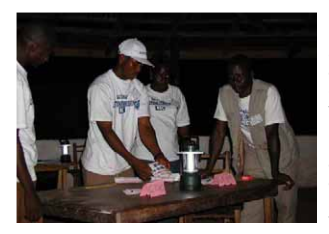
Polling officials count runoff ballots in Tapita, Nimba County.

In a few cases, the delegation noted inconsistencies in polling place administration. For example, some polling agents voted before the polls opened rather than at the end of the day as stipulated in the revised election procedures; the procedure for reconciling ballots at the end of the day was not followed in a few instances; the numbers of ballots received were not always registered on the presiding officer's worksheet; and the number of party representatives allowed in polling places varied from site to site. Observers were informed that in a number of polling sites, larger sample ballots posted in ballot booths bore marks indicating the choice of a candidate, though in all cases these ballots were immediately removed as soon as the attention of the polling officer was drawn to them.