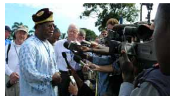
Former President Nicéphore Soglo of Benin and former U.S. President Jimmy Carter brief the media on the NDI/Carter Center international observation delegation for the first round election.

The Liberian media played an important role in informing and educating the Liberian public about the electoral process. Radio stations were particularly useful in disseminating information in English and local languages. The effectiveness of newspaper coverage was limited, as the illiteracy rate for the country is estimated at 80 percent. Distribution of print media is also limited to the parts of the country that are accessible by road.