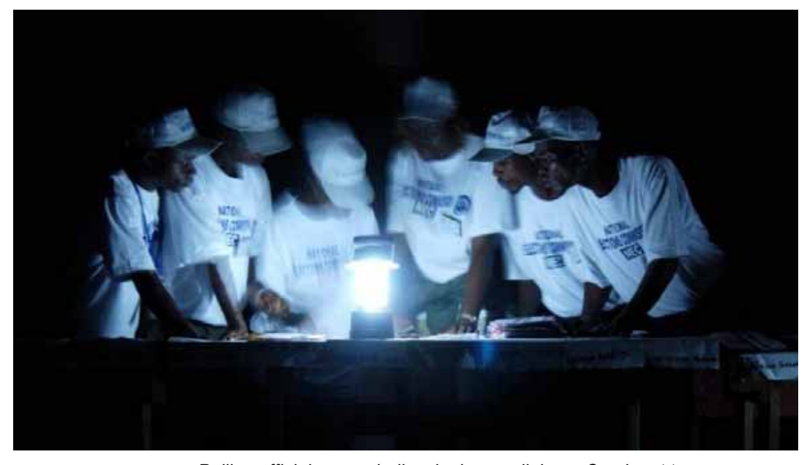
Polling officials count ballots by lantern light on October 11.