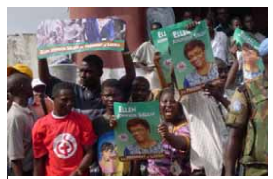
Unity Party supporters rally in support of Ellen Johnson Sirleaf for president.

The NEC's Campaign Finance Guidelines were comprehensive and wide reaching, although they proved difficult to enforce given incountry conditions at the time of the election. Campaign finance regulations set restrictions on the source of campaign funds, prohibited the use of bribes to entice voters, and imposed disclosure requirements to make all campaign finance information public.