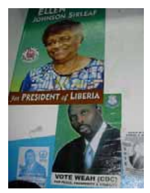
Campaign posters for Ellen Johnson Sirleaf and George Weah, the two runoff candidates.

As the campaign drew to a close, more incidents were reported of civic and community-based organizations, government figures, and media outlets engaging in partisan activities. Political rhetoric became increasingly inflammatory in the final days of the campaign period, raising concerns of election-related violence. However, the campaign period for the second round of election ended on November 6 without any major incidences.