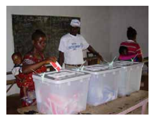
A voter casts her ballots on October 11.

Senate ballots averaged 10 candidates per county. Sample ballots were prepared by the NEC to assist in voter education efforts; however, they were only delivered to the counties several weeks in advance of the election.