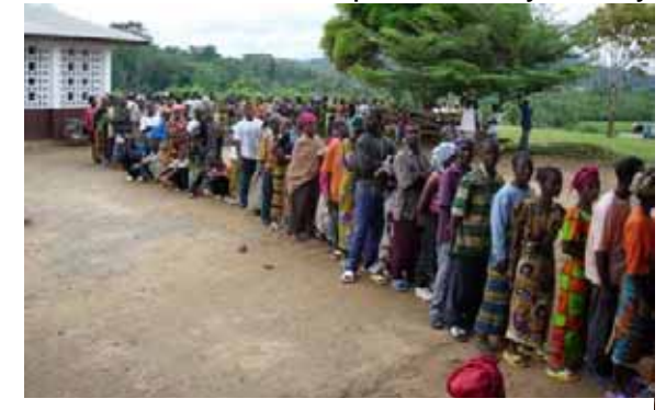
Voters wait in line for hours to vote on October 11.

downpours during the rainy season. Approximately 10 percent of the electorate voted in polling places that were not accessible by road, requiring polling agents to trek for four days in some cases to deliver polling materials to points where they could not be transported by vehicle. Some of these were in areas difficult to reach even with the assistance of UNMIL helicopters. The NEC and UNMIL made extraordinary efforts to ensure delivery and collection of polling materials to and from these locations.