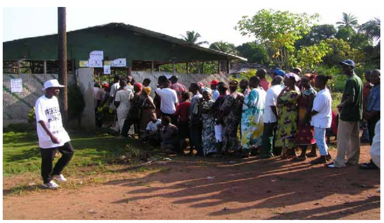
Liberian voters wait in line at a polling precinct in Grand Bassa County.