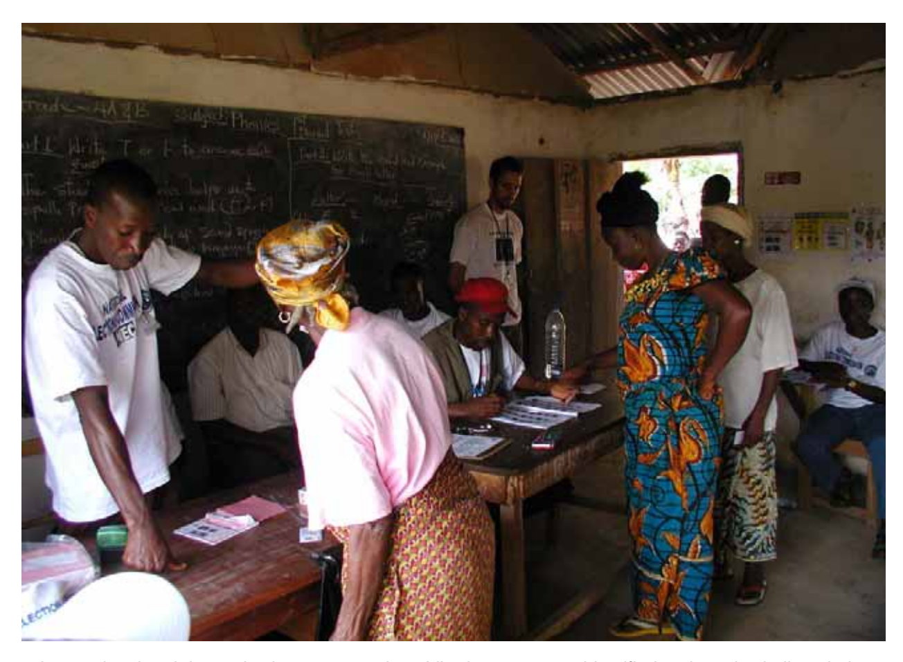
International and domestic observers watch as Liberian voters are identified and receive ballots during the runoff election.

NDI and The Carter Center also wish to express their deep appreciation to Liberian government officials, political and civic leaders, election commissioners, and poll workers who facilitated the work of the delegation. Most important, NDI and The Carter Center would like to thank the Liberian people for their warmth and hospitality.