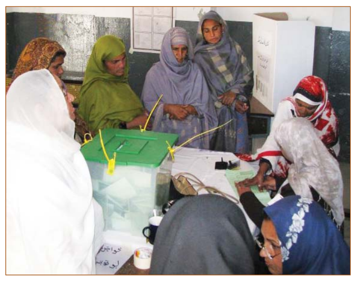
Women in Islamabad vote in February parliamentary elections

Despite a seriously flawed process, Pakistani voters chose a return to democratic rule over dictatorship in February parliamentary polls. Opposition candidates swept to victory over the party of President Pervez Musharraf, leading to the formation of a coalition government led by historic political rivals, the Pakistan Peoples Party of former Prime Minister Benazir Bhutto, who was assassinated seven weeks before the election, and the Pakistan Muslin League-N, led by former Prime Minister Nawaz Sharif.