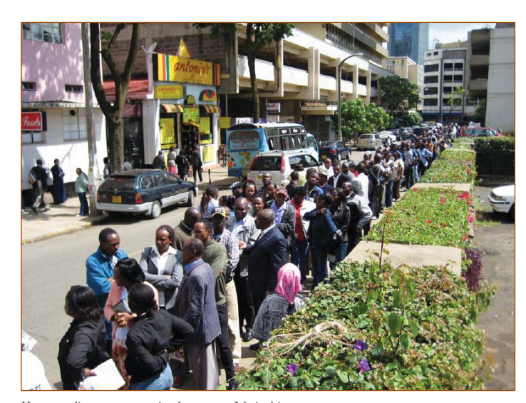
Kenyans line up to vote in downtown Nairobi

Since 1992, NDI has worked with Kenya's civic organizations to monitor election processes and assist the long-term development of the country's political parties. NDI also helped establish Inter-Party Provincial Committees (IPPCs), which provided a neutral setting for dialogue between political parties, the Electoral Commission of Kenya and community elders. The IPPCs, which were held