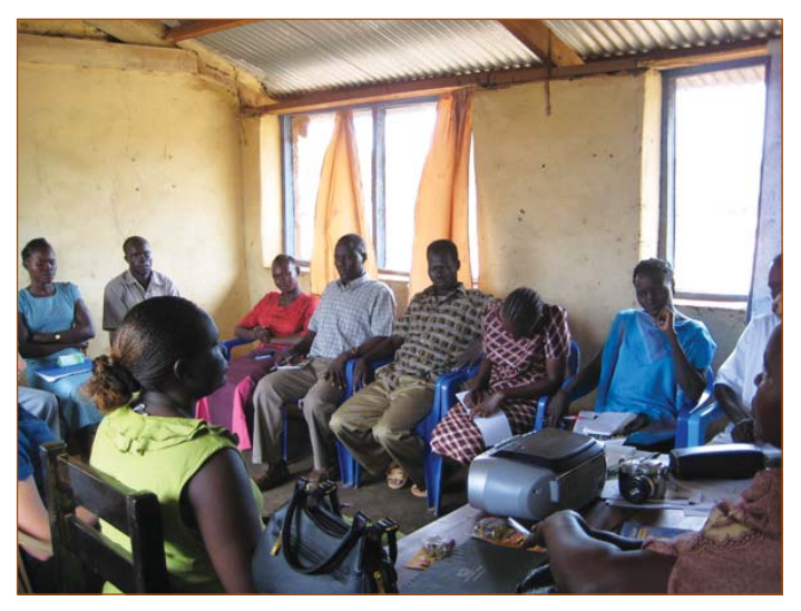
Listening group in a schoolhouse in Juba, Sudan

Listeners to civic education broadcasts are learning about the basic constitutional and democratic principles advanced by the 2005 Comprehensive Peace Agreement (CPA) between the government of Sudan and the Sudan People's Liberation Movement that ended 21 years of civil war in Africa's largest country. The information will enable citizens, for the first time, to play a role in the development of new political institutions as they prepare for 2009 elections and a 2011 referendum on southern independence.