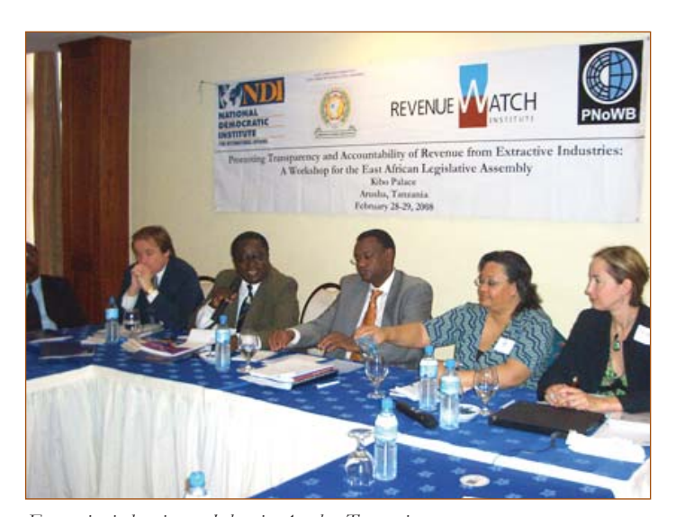
Extractive industries workshop in Arusha, Tanzania

Angola, Botswana, Chad, the Republic of Congo, the Democratic Republic of the Congo, Ghana, Nigeria, Sierra Leone and South Africa. NDI reviewed legal and other