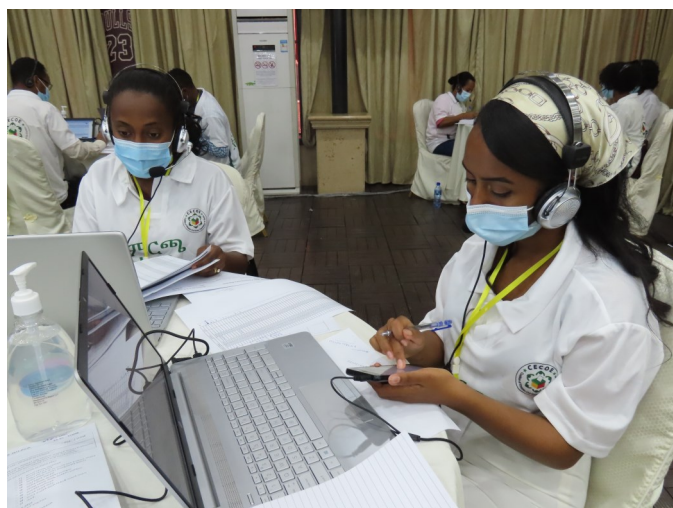
Two women engaging in election monitoring work at a data center during the June 2021 Ethiopian general elections

being closed off both democratically and socially to the outside world, NDI has found that partners are reluctant to embrace more progressive norms and paradigms that are necessary for sustained progress. In addition, because of ongoing conflict in the region and donor approaches being unpredictable, if there is a significant shift in funding priorities that could severely impact on gains made this can also affect the possibility of achieving sustainable outcomes. Similar to other staff perspectives, in order to achieve sustainability, continued investment in the same partners and priorities for a significant period of time payoffs.