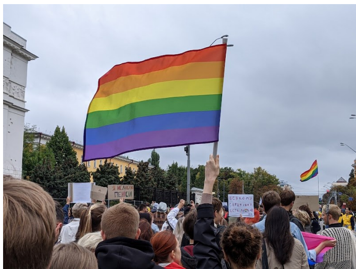
An individual holds up a LGBTQI+ pride flag at the annual KyivPride march in Ukraine.

Norms consist of informal, agreed-upon expectations and rules within a society that are developed and maintained by the collective views of its members. These deeply rooted perceptions shape individual and collective action and interactions and are a powerful predictor of behavior. Too often, prevailing norms impact the ability to achieve sustainable democratic outcomes by limiting types of participation, excluding voices from political processes, and creating perceptions that political practices such as vote buying, withholding of public information, or coercion are normal and acceptable. Certain actors also benefit from maintaining the status quo and are therefore incentivized in upholding certain norms that lead to fragility and undemocratic outcomes.