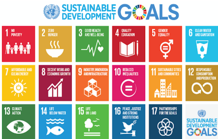
The United Nations’ 17 Sustainable Development Goals, intended to be achieved by 2030.

Power dynamics, and more specifically power imbalances, act as a major obstacle to achieving sustainable democratic outcomes. Power imbalances often serve as barriers to meaningful citizen participation by keeping decision-making power concentrated in the hands of a few elite actors and restricting opportunities to organize collectively. Developing greater power and influence are acute needs for groups who have been historically marginalized and are struggling to combat discrimination and inequality. Securing their rights involves gaining power over political decision-making. Powerful actors, such as governments, often control decision-making processes, resulting in benefits for dominant groups, which may also hinder the development of social capital in communities. Amidst the backdrop of COVID-19, malignant actors seized opportunities to consolidate power which diminishes trust in government institutions and weakens social contracts. Exclusion and marginalization also sow seeds for future conflict, which creates an environment where programs and initiatives may have limited positive impacts on sustainability.