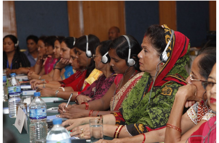
Women leaders from 10 major Nepalese political parties at an NDI organized campaign training.

Operating in a country such as Nepal has enabled NDI to have transparent and candid conversations with donors about sustainability and what is required to produce sustainable outcomes. NDI has noted the need for donors to fund longer-term and multi-year programs that focus on institution building and targeted support to policy reforms that are informed by citizen needs. NDI has also noted the need for continued support to the same partners to enable them to build the necessary skills and capacities to sustain democratic progress. This not only leads to stronger buy-in from partners in continuing the work but also overcomes challenges