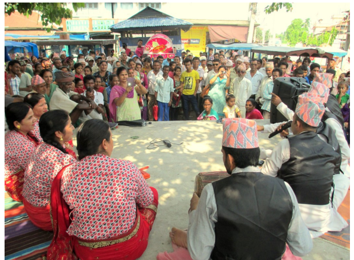
NDI supported a voter registration and voter education program carried out in a local musical performance format in Nepal.

The forest and natural resource management movements began using the term “sustainability” as a way to describe the ability of ecosystems to respond to shocks and stresses triggered by economic growth, natural disaster and environmental degradation. For ecologists, the concept of sustainability not only captures the ability for ecosystems to respond, but also considers how to meet basic human needs without triggering major ecosystem collapse. Based on this thinking, members of the United Nations came