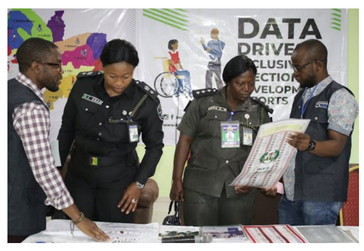
IFA explaining the use of the Braille ballot guide in Nigeria

Equally important to the success of NDI's partnerships has been creating a structured space for clear, frank two-way conversations