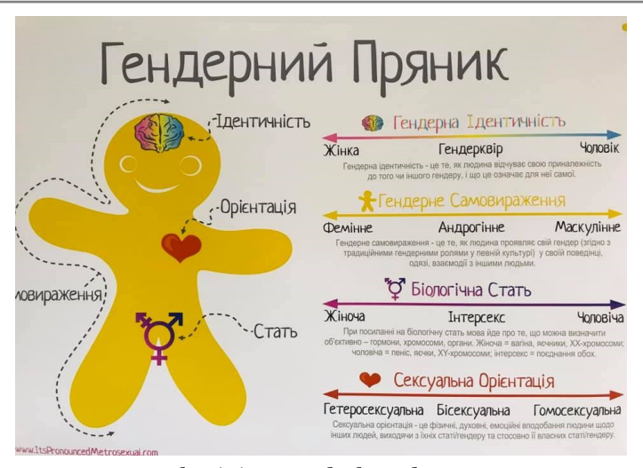
Ukrainian Genderbread Person

The Ukraine team has worked with partners to identify success stories over the years, noting that the celebration of small victories and a positive outlook can create momentum for continued progress. NDI's partner, CSO Sphere, is a lesbian-feminist LGBT+ organization that organized the first Pride in Kharkiv, Eastern Ukraine. PrideKharkiv, gathering 3 thousand people, is particularly notable given that the Kharkiv oblast borders with Russia, has a complicated political context, and is very close to an active war zone. CSO Sphere was able to work through those challenges to build support for a pride movement that increases visibility