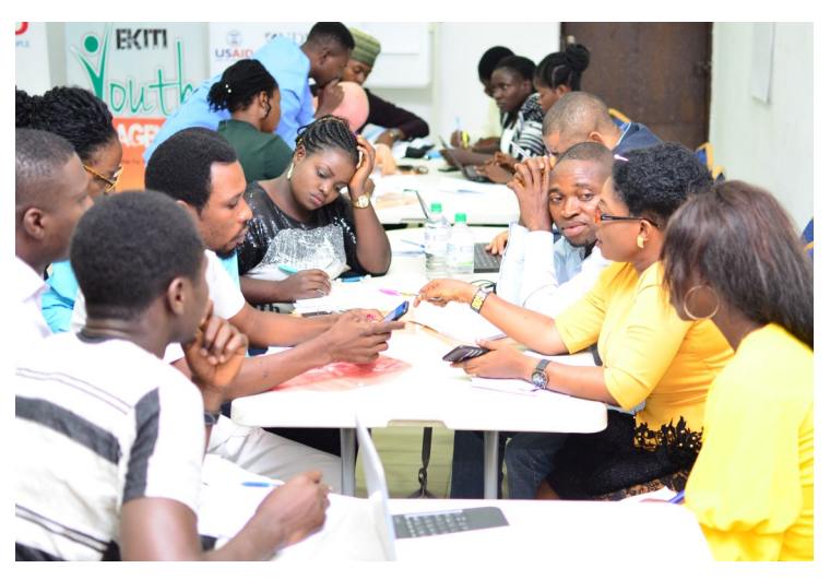
Group work during an advocacy and community organizing training for members of the Ekiti Youth Agenda campaign in Ekiti state, Nigeria

The close and enduring relationships NDI has with local civic organizations are an important asset when dealing with these unprecedented changes requiring rapid program adaptation. For instance, the operational understanding that NDI and partners have of one another, and the direct lines for two-way communication make managing change less challenging.