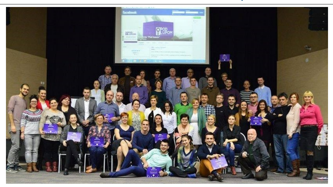
Election Observation Project, Pod Lupom Evaluation Meeting in Bosnia and Herzegovina

"big cooperation and assistance." This included building specific processes related to election observation, best practices in supporting observers, and post-election data analysis and reporting. It wasn't long before Pod Lupom became a nationally recognized coalition, effectively monitoring the 2014, 2016, and 2018 general elections as well as transferring their skills to other political activities such as monitoring political party finances and establishing a database to track disinformation. Pod Lupom's capacity and expertise on election monitoring systems is so extensive that NDI now utilizes the coalition to provide technical assistance in other parts of the region and elsewhere in the world, including Georgia, Armenia, Kyrgyzstan, and North Macedonia. NDI remains a strategic partner to both CCI and Pod Lupom, currently supporting Pod Lupom in creating a digital application for party poll watchers to quickly report irregularities on election day.