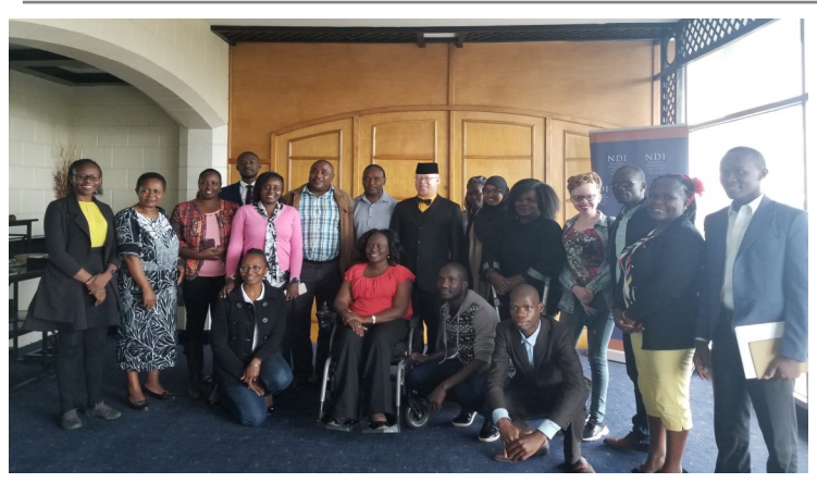
Disability and Human Rights Stakeholders Forum Participants in Kenya

resulting in the need for stronger relationships between organizations and space where organizations could build skills in data collection and analysis, re-establishing their standing in the community in time for the 2010 elections.