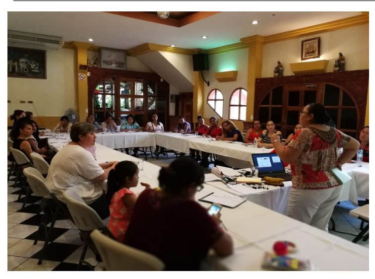
Alas de Mariposa conducts a workshop on the Electoral and Political Parties Law, which requires political parties to alternate between male and female candidate nominations to promote gender parity.

government accountability. The team also convened cross-sectoral technical working groups made up of local partners to share expertise on strengthening electoral processes. Throughout these efforts NDI prioritizes research and evidence-based approaches, especially when supporting highly polarized political activities where the integrity and credibility of the entire process is at stake. Placing partners at the forefront of program activities and working groups reinforces NDI's role as a facilitator, building relationships and providing technical guidance. NDI approaches partnerships with the aim of understanding, but not reinforcing power dynamics, which have historically plagued partnerships between external and local organizations. This includes prioritizing partner priorities in program design, developing shared visions and plans, treating partnerships as alliances and spaces for exchanging ideas and expertise, and finding the right balance throughout program implementation. According to NDI's Resident Director, "it's about treating partners and the people who make up partner organizations with respect and kindness.'