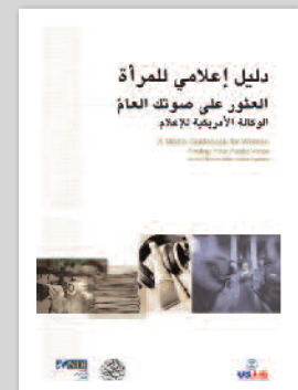
A Media Guidebook for Women