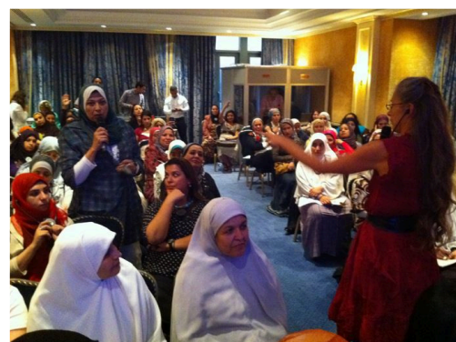
NDI's Campaign School for Women Alexandria - September 10-11, 2011