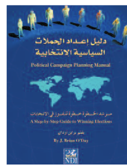
Political Campaign Planning Manual