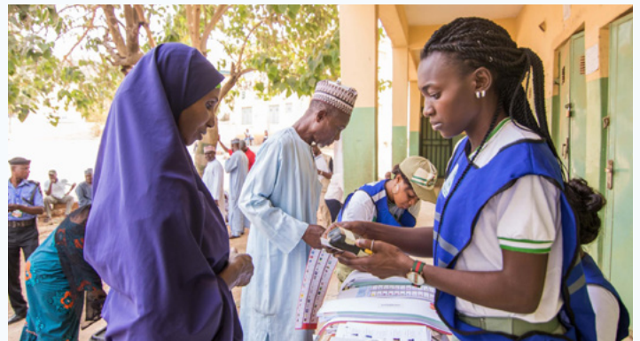
NDI/IRI joint election observation mission monitors voting process in Abuja, Nigeria.