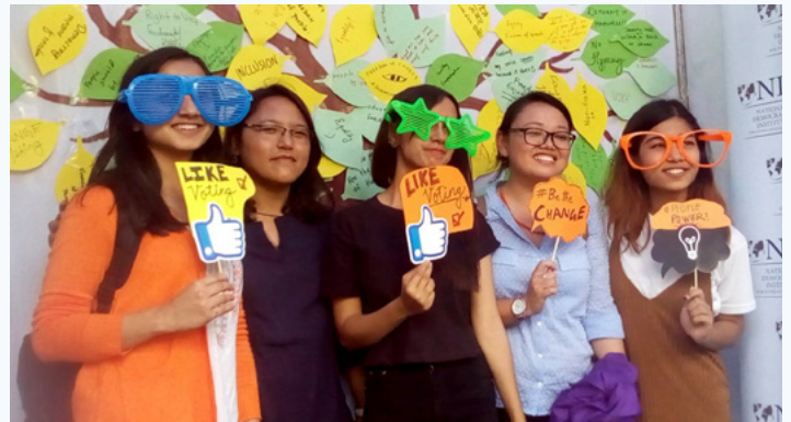
NDI helps youth find their voice, engage in the political system and make meaningful change in their communities.

Despite making up more than half the population in many countries, young people are often shut out of mainstream politics and decision-making. NDI helps young people become political leaders and activists by breaking down barriers, developing technical skills and building intergenerational relationships. Through the Change My Community Toolbox , NDI helps young people run grassroots advocacy campaigns. The Youth Leading Debate program hones skills on the art of policy debate. The Ana Usharek (I Engage) program has helped infuse tens of thousands of Jordanian students from universities and public schools with democratic values of civic responsibility and activism so they can become more fully invested in their country's future.