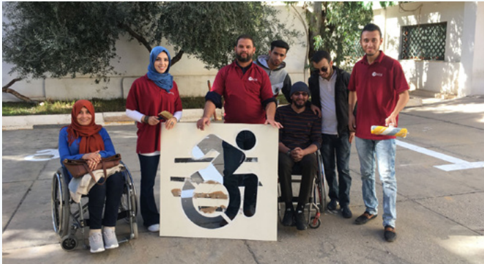
In Libya, with NDI support, eight disability rights organizations advocate to improve accessibility to public buildings and universities.