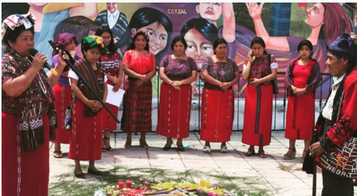
Mayan ceremony at launch of NDI programs to support inclusion and reduce violence in Guatemala.