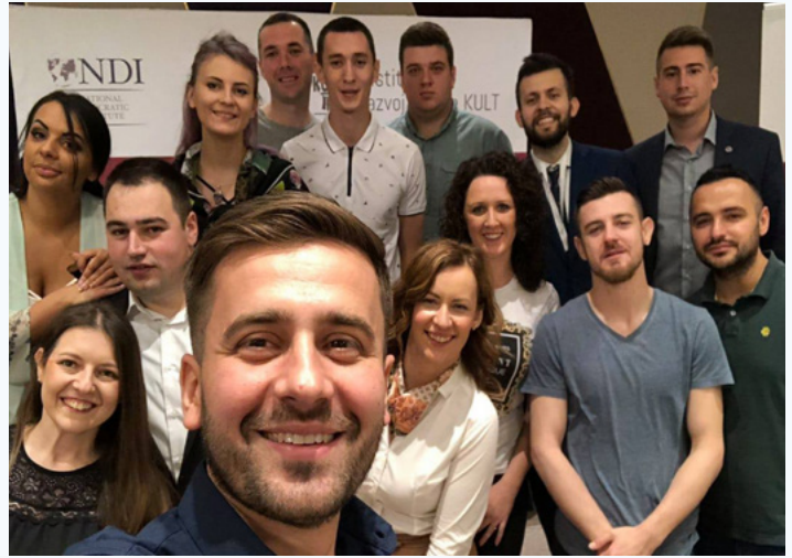
Young leaders from nine Bosnian political parties discuss how to spur business, encourage young entrepreneurs and increase professional skills at a NDI-sponsored event.

A democracy can thrive only when it represents all citizens equally. Yet in new and emerging democracies, large portions of the population are often excluded from politics based on their ethnicity, religion, age, disability, gender or sexual orientation. To ensure no citizen's voice is silenced or democratic rights stifled, NDI helps representatives from these communities run for political office, advocate for legal reforms and pressure governments to implement international agreements protecting their rights, such as the UN Convention on the Rights of Persons with Disabilities.