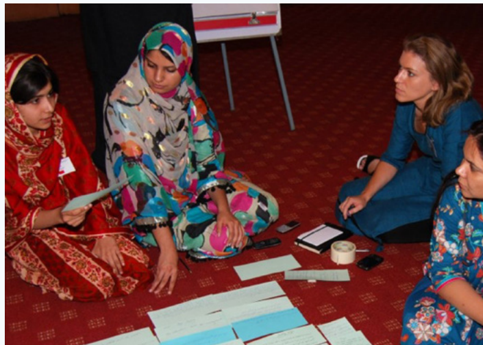
Nobel Prize laureate Malala Yousafzai (left) participates in an NDI program for women and youth in Pakistan in 2010.

When women participate in politics, the results can be socially and economically transformative. NDI helps women overcome barriers to political involvement through the Win With Women assessment, Women Mayors' Network and ready-to-run campaign schools. The #NotTheCost initiative collects data on threats women face from violence, and the groundbreaking think10 safety planning tool helps women identify their personal and professional vulnerabilities. Together with the Office of the UN Special Rapporteur on Violence Against Women and Girls, NDI is helping women political leaders report instances of violence and build the case for greater global action. NDI is also part of the DISRUPTHER initiative to deepen the pool of adolescent girls with the political skills and aspirations to become political leaders.