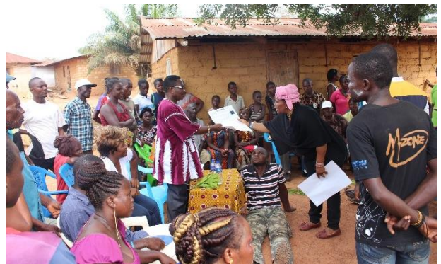
Liberian women activist presents the 2017 Liberian Women's Manifesto during a community meeting.