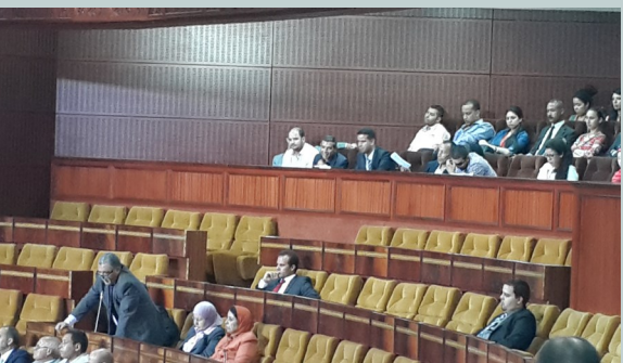
MP assistants shown assisting to the plenary session of the parliament during a visit organized by the NDI