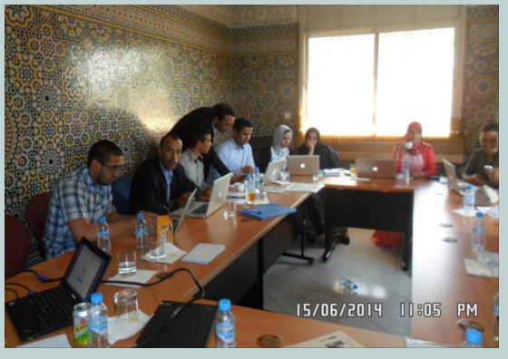
MP assistants during one of NDI's coaching session

On June 16 and 17, NDI hosted the constituency offices assistants in Rabat to review the program's key achievements and introduce the expanded program for 2014-2015. At the gathering, the assistants shared their various successes and challenges engaging with constituents through the local offices. NDI also reinforced the importance of record keeping and trained the assistants to use basic physical and electronic results tracking. NDI also accompanied the assistants to the plenary session of parliament.