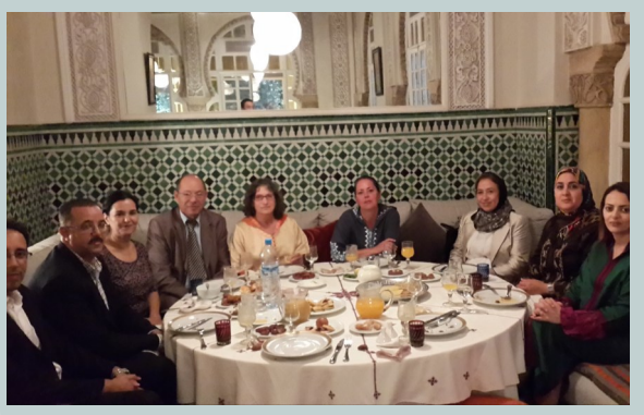
Participating MPs in company of NDI staff during the Iftar gathering

On July 15, the National Democratic Institute (NDI) hosted a Ramadan iftar gathering for participating members of parliament in the Constituency Outreach Project. At this event, MPs shared updates and recent accomplishments from their work through the constituency offices.