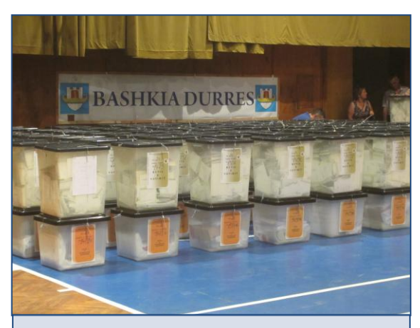
Ballot boxes stacked in a counting center in Durres.

coalition Alliance for Employment, Welfare and Integration , winning 84 out of 140 seats. The SP-led government will now be expected to deliver on its campaign promises in the face of an increased demand for an accountable and responsive government.