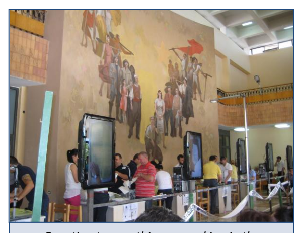
Counting teams, this one working in the historical museum in Lushnje, a city in the district of Fier, scan each ballot so that observers may see how they are marked.

Interlocutors with whom NDI spoke described these elections as a triumph of the Albanian public and a distinct sign that voters finally recognize the power of their vote to affect change. In a telling moment, one police officer and self-described DP-supporter informed NDI he was happy with the elections, calling them "a true reflection of the people's will," encapsulating the frustration felt by many Albanians with the numerous controversial and disputed elections of the last 20 years.