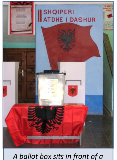
A ballot box sits in front of a voting station in a polling station in Fier.

The CEC continued to operate with only four members, as detailed in <u>previous NDI reports</u>. Despite concerns about the body's ability to operate impartially on the voting and counting days, the CEC mainly took decisions to address non-controversial administrative issues, such as the substitution of CEAZ members and replacing missing electoral materials. With the SP stating that its nominated CEC members would not return to the body, uncertainty remains over the certification of the election results, which the CEC cannot do with only four votes. The certification process, which is expected to be carried out by the Electoral College, should be completed in a timely and judicious manner.