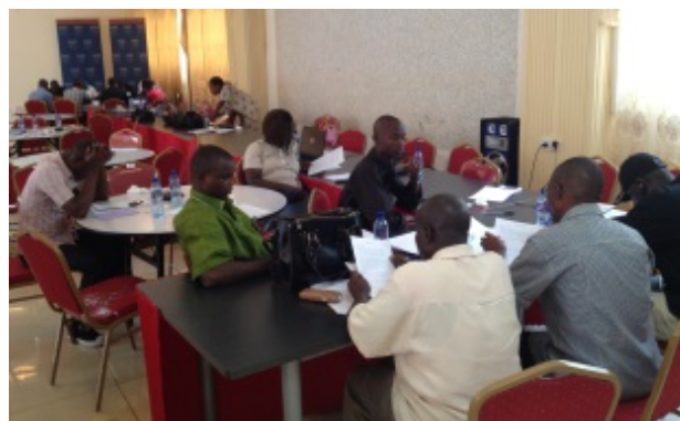
Participants at NDI's workshop

After the baseline assessment, NDI conducted two introductory workshops