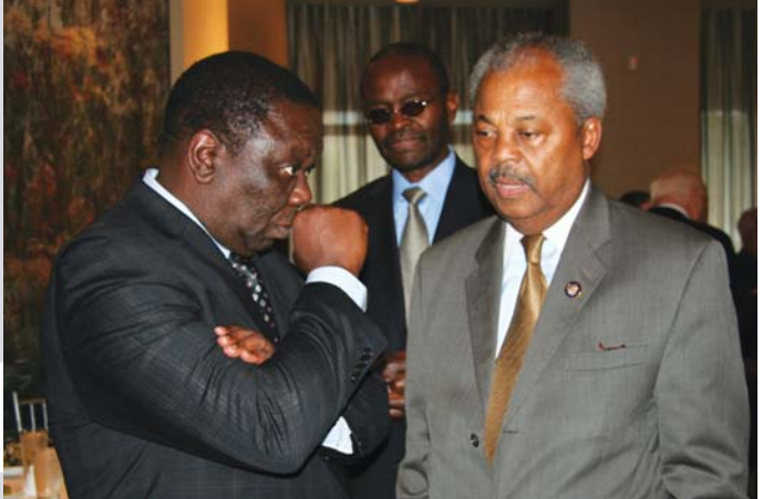
Zimbabwe Prime Minister Morgan Tsvangirai and Congressman Donald Payne

Good governance and political accountability are in the interest of everyone, including the private sector. NDI can help corporations develop a greater understanding of global political challenges and provide an opportunity to join the discussion on how the private sector can contribute to advancing democracy and human rights around the globe.