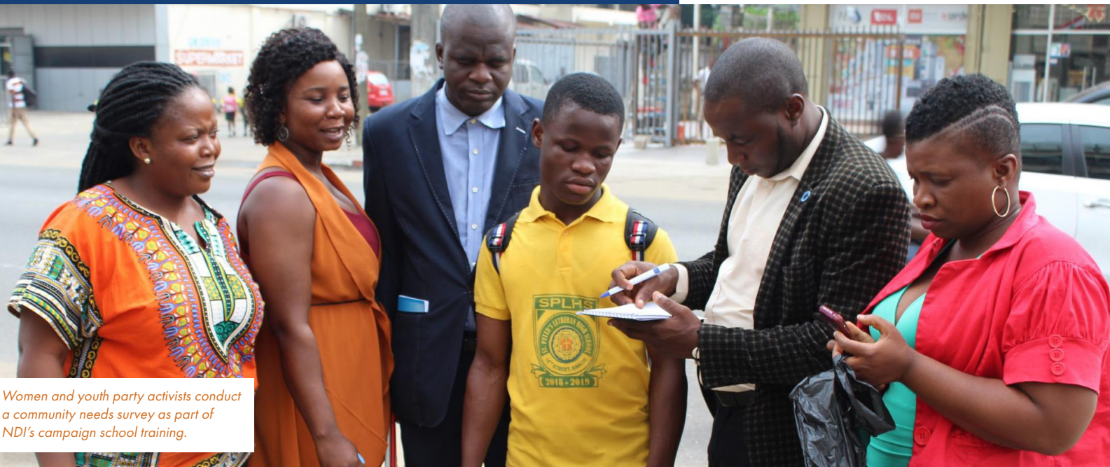
Women and youth party activists conduct a community needs survey as part of NDI's campaign school training.

NDI's current program in Liberia is funded by the U.S. Agency for International Development (USAID).