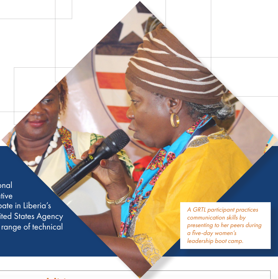
A GRTL participant practices communication skills by presenting to her peers during a five-day women's leadership boot camp.

Fifteen years after Liberia's democratic transition, the country faces a new set of challenges in strengthening its institutions and making them more representative. The National Democratic Institute (NDI) is implementing a five-year initiative to strengthen the capacity of political parties to participate in Liberia's electoral and political processes. With support from the United States Agency for International Development (USAID), NDI is providing a range of technical assistance to all registered political parties in Liberia.