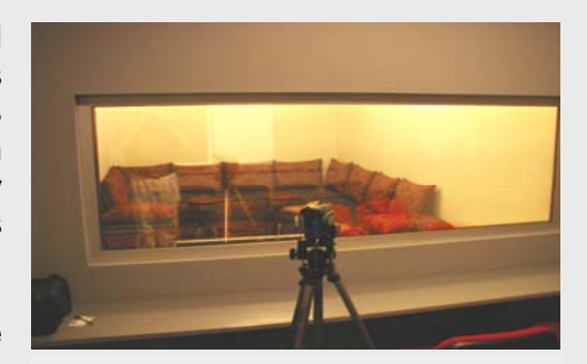
The People's Mirror Strategic Research Center, located in Rabat, Morocco, was established by NDI with NED funding.

Staffing. Identifying staff with the right combination of language and social skills, experience in this field, and a sufficient grasp of the political and social issues in Morocco proved to be quite challenging. We were fortunate to recruit employees with a range of experience in field operations, polling and marketing, and