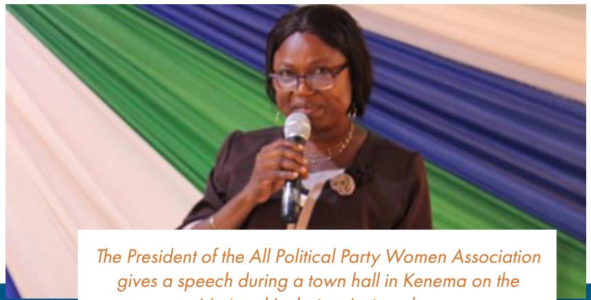
The President of the All Political Party Women Association gives a speech during a town hall in Kenema on the National Inclusion Action plan.