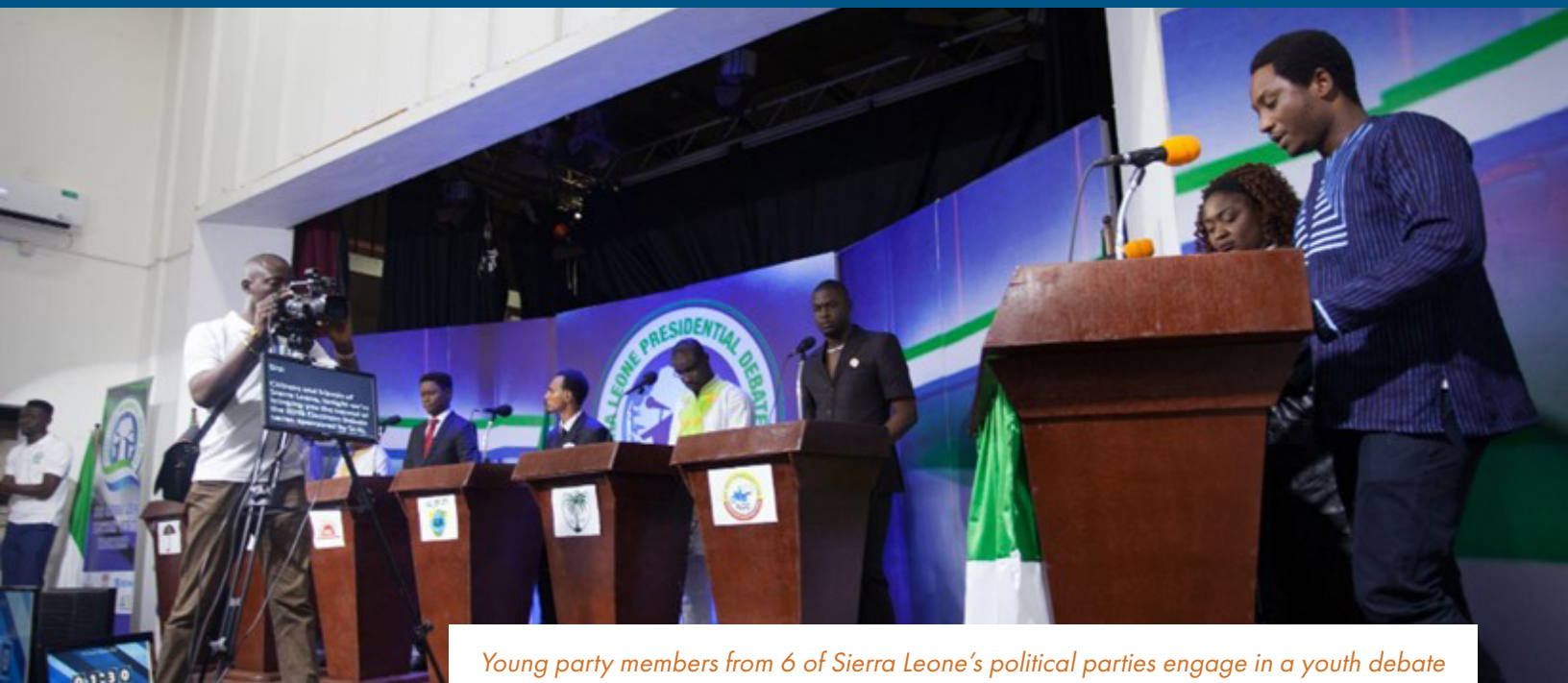
Young party members from 6 of Sierra Leone's political parties engage in a youth debate

NDI's current work in Sierra Leone is funded by the National Endowment for Democracy and Global Affairs Canada. Previously programming has been funded by the United States Agency for International Development, United Nations Development Programme, and the UK Department for International Development (now the Foreign, Commonwealth & Development Office).